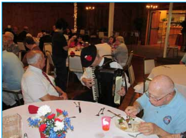
The Slovenian community in Bethlehem has sister-cities relationship with Murska Sobota in 1996. Following the flag-raising event was a traditional luncheon at Saucon Valley Acres.