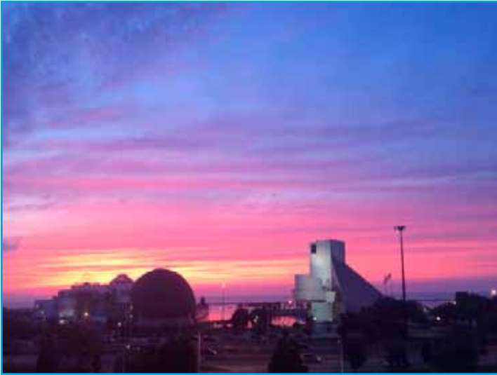
The biggest Slovenian community in the U.S. lives in Cleveland, OH.