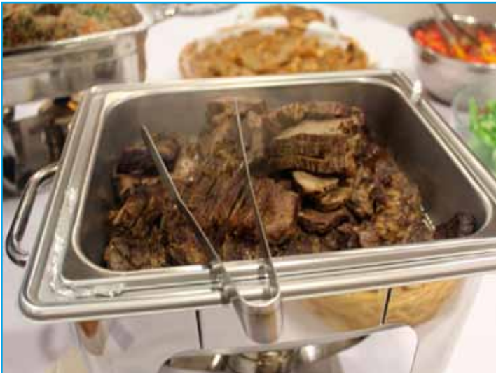
At the reception, the guests enjoyed the best of Slovenian wines and food typical of various Slovenian regions.