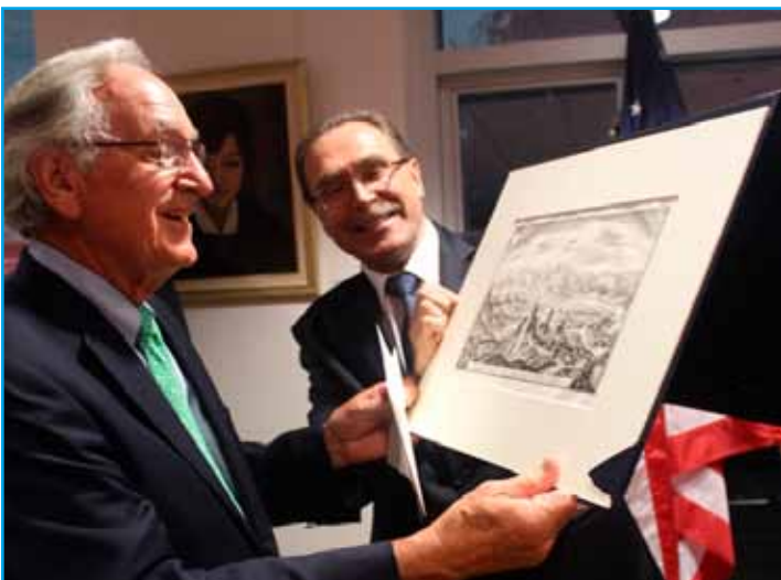
Senator Harkin receiving an original print of Škofja Loka, the town where his mother's family originates.