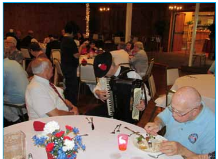
The Slovenian community in Bethlehem has sister-cities relationship with Murska Sobota in 1996. Following the flag-raising event was a traditional luncheon at Saucon Valley Acres.