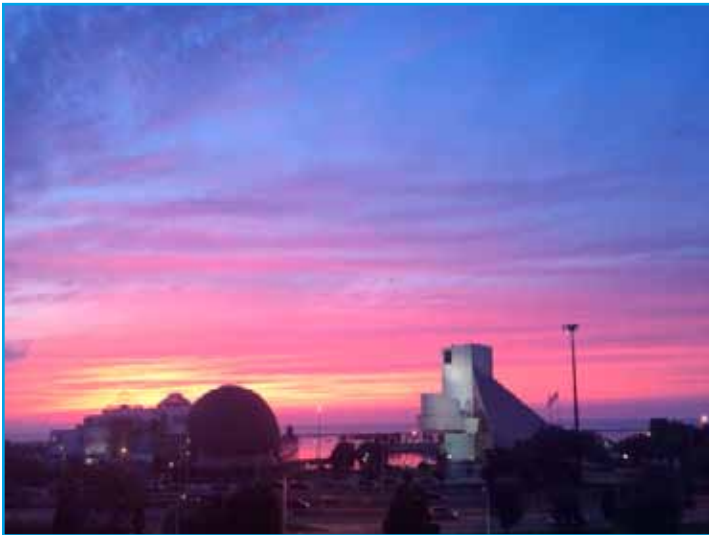
The biggest Slovenian community in the U.S. lives in Cleveland, OH.