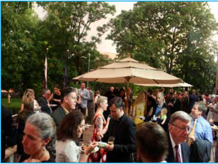
Opening of the terrace after an evening shower.