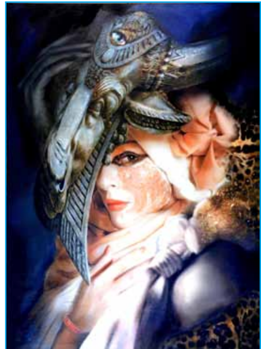
Feelings - The Twilight Possessor - Mik - oil on canvas - 25,6 in x 35,4 in.

Exhibitor list: http://artexponewyork.com/artexpo-new-york/exhibitor-list/