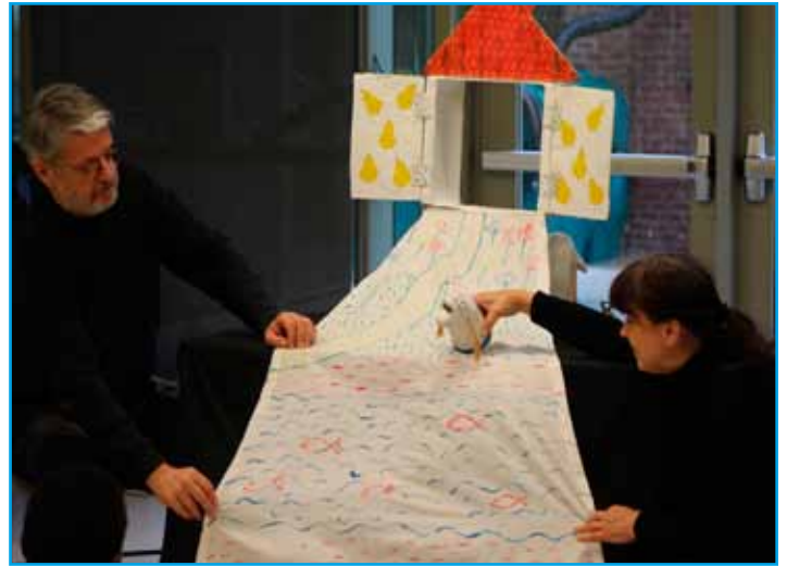
The stories were brought to life through interactive performance.

interactive performance with live music played on traditional instruments from around the world.