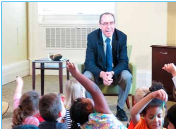
Storytime with the Ambassador at the Young Readers' Center at the Library of Congress.