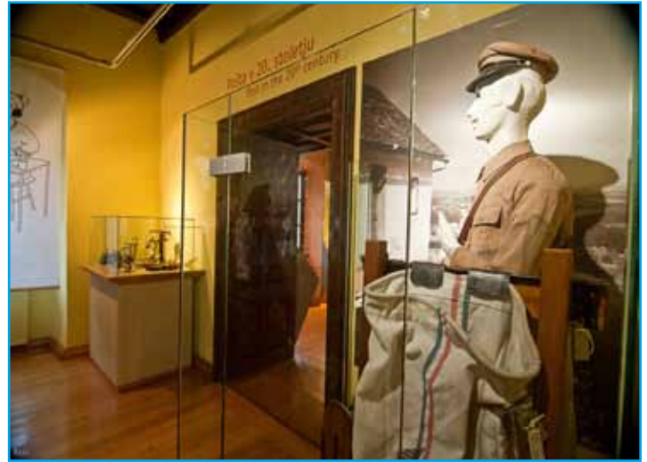
The Postal and Telecommunications Museum is housed in the Polhov Gradec Castle.

What better way to learn about Slovenia's history, art and heritage than by visiting various museums spread throughout the country? When making a list of things to do in Slovenia, do not forget about interesting galleries and museum collections. We will do our best to introduce as many as possible in our newsletter.