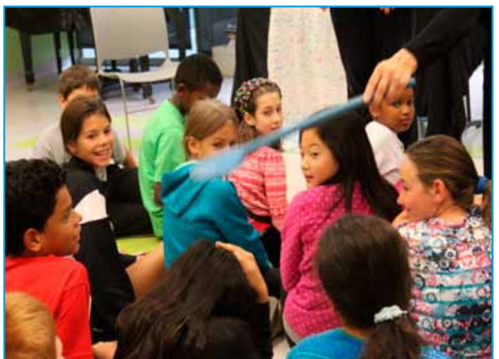
Performance at the Horace Mann Elementary School.