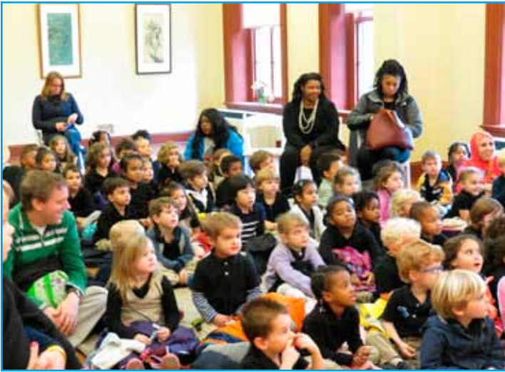
Show at the Hill Center.