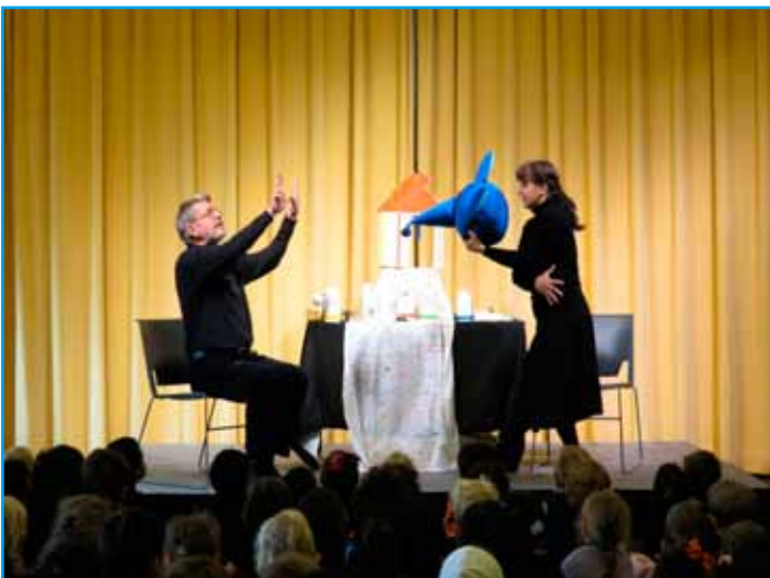
The play Miška kaško kuhala/The Mouse was cooking Porridge.