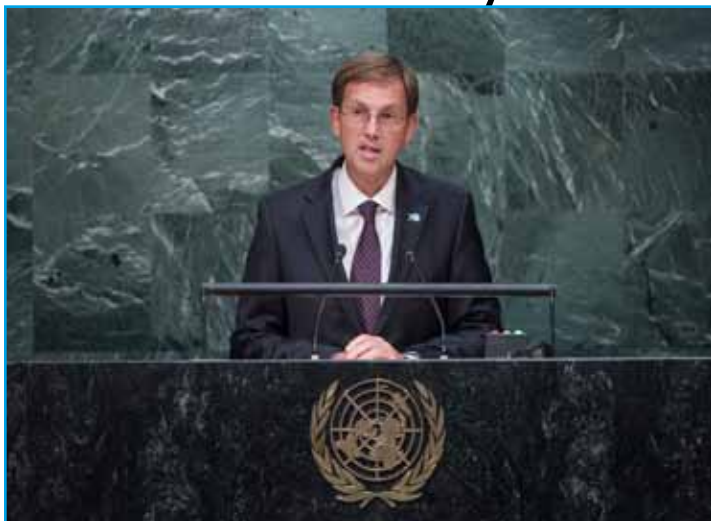
PM Dr. Cerar addresses United Nations General Assembly.