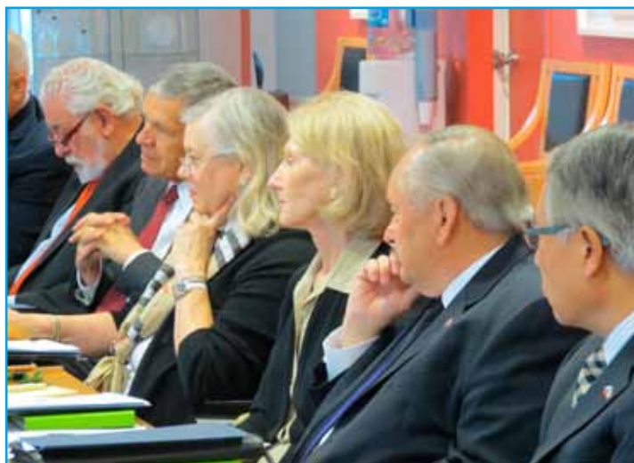
The gathering was also an opportunity for the consuls to inform on their activities throughout the year.