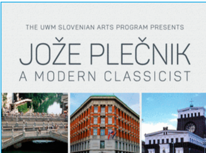
Poster for the lecture.