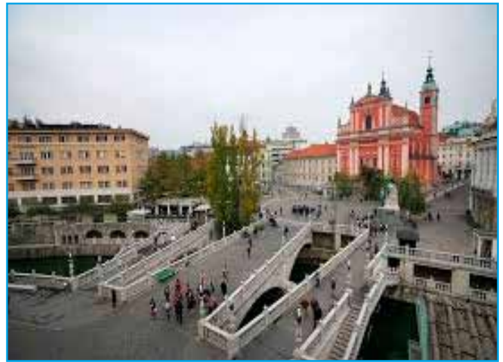
Three Bridges in Ljubljana, by Plečnik.