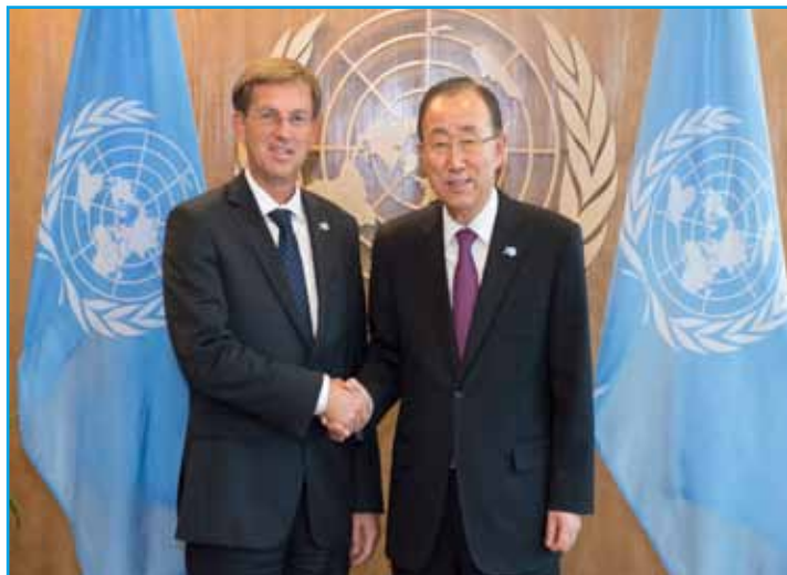
Meeting with U.N. Secretary-General Ban Ki-moon.

Slovenian Prime Minister, Dr. Miro Cerar, departed for New York on September 24 to attend the 70th U.N. General Assembly session. First, on September 25, he took part in a U.N. development summit discussing the 2030 Sustainable Development Agenda and co-chaired, with Prime Minister of Saint Vincent and the Grenadines, Ralph Gonsalves, an interactive dialogue session of the Summit dedicated to the issue of poverty and hunger. On September 27, he attended the meeting of global leaders on gender equality and women's empowerment. On September 28, he joined a welcome reception hosted by U.N. Secretary-General Ban Ki-moon - for heads of delegations, as well as a reception given by U.S. President Barack Obama. On September 29, he attended a high-level event on the fight against terrorism and violent extremism and, on September 30, a high-level event on migration, and a preparatory conference for the World Humanitarian Summit.