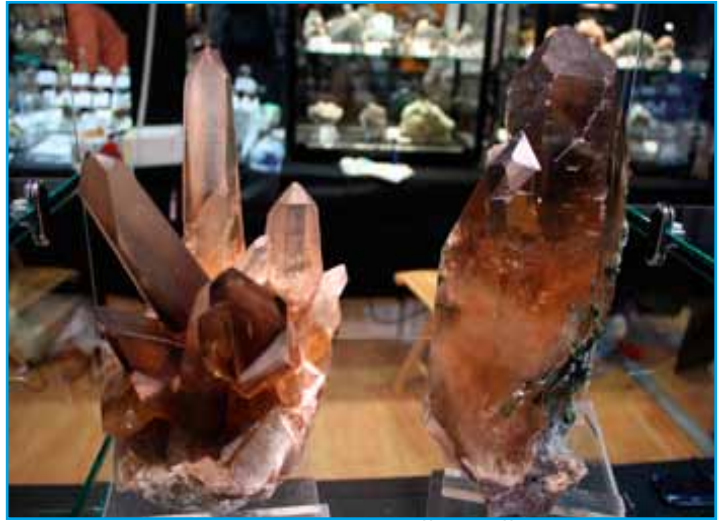
The House of Minerals.

What better way to learn about Slovenia's history, art and heritage than by visiting various museums spread throughout the country? When making a list of things to do in Slovenia, do not forget about interesting galleries and museum collections. We will do our best to introduce as many as possible in our newsletter.