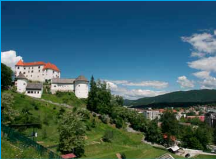
Velenje Castle.