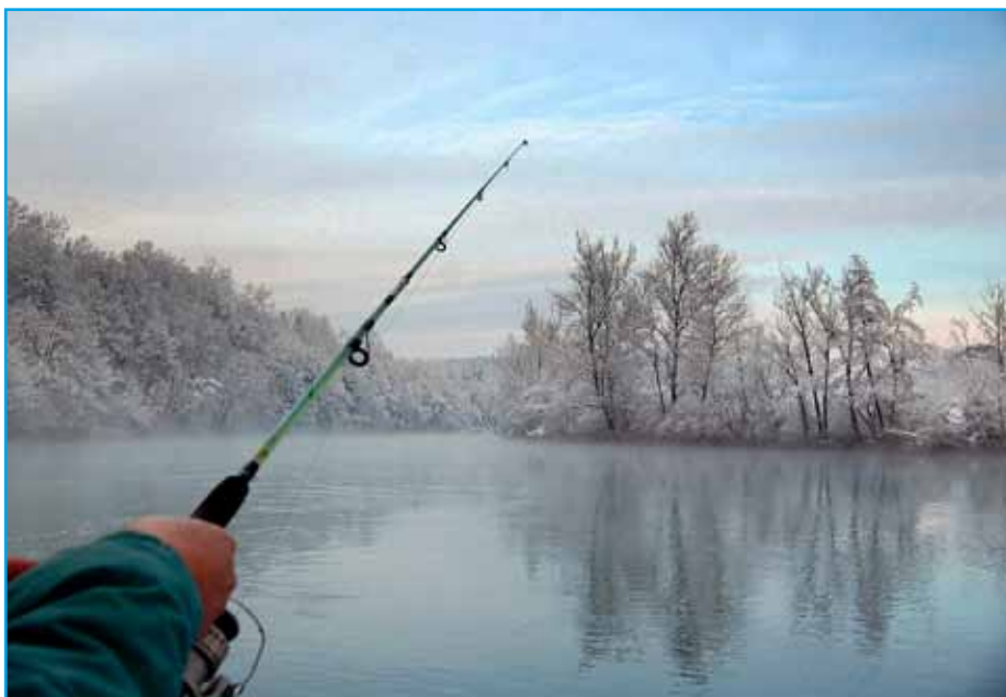
The rivers and lakes in Kočevje are ideal for fly-fishing.

The village of Kočevska Reka with its vicinity is known for the status it held from 1949 to 1990, when the area was closed to the public due