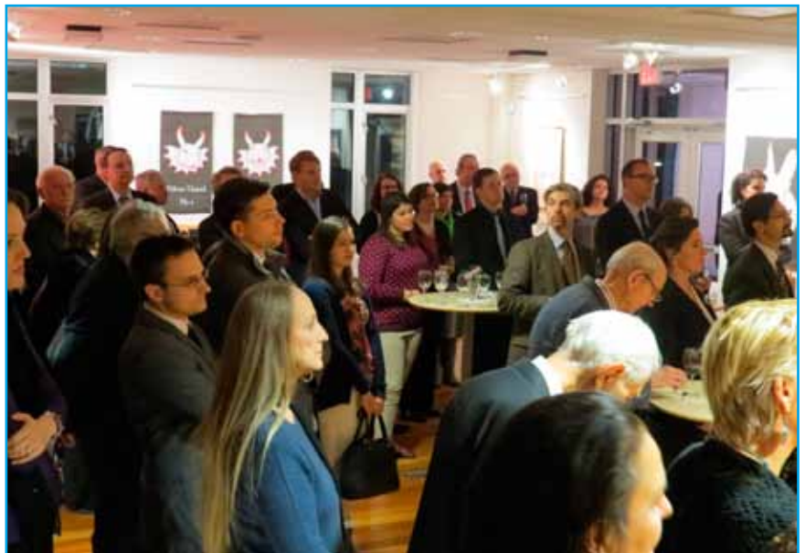
The event was attended by more than 100 guests.

In his address to over 100 guests, Ambassador Dr. Cerar outlined the poet's contribution to Slovenia's national identity and his distinctive contribution to the formation of Slovenia as a nation, having lifted the Slovenian language to the European level of literally expression. Besides the ambassador, European Parliament Member and the first Prime Minister