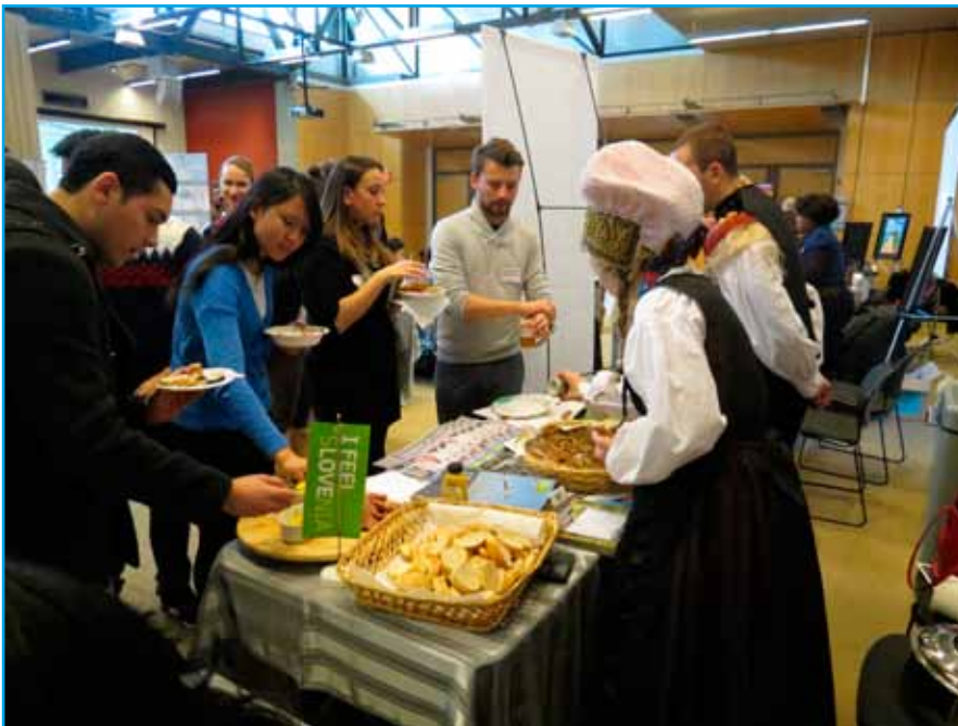
Slovenian booth was very popular among visitors.

On Friday, January 30, the Catholic University of America (CUA) for the fourth year hosted an Open House and the Embassy Exhibit event, which aimed to capture the sights, sounds, and