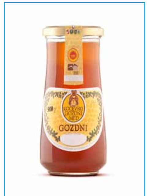
Kočevje forest honey with the European Designation of Origin.

Another place to visit is the Borovec nature educational trail and take a walk through pristine nature – the jungle of Krokav and the Krempa nature reserve. Each spring, the grass-covered Krempa col transforms into a carpet of daffodils.