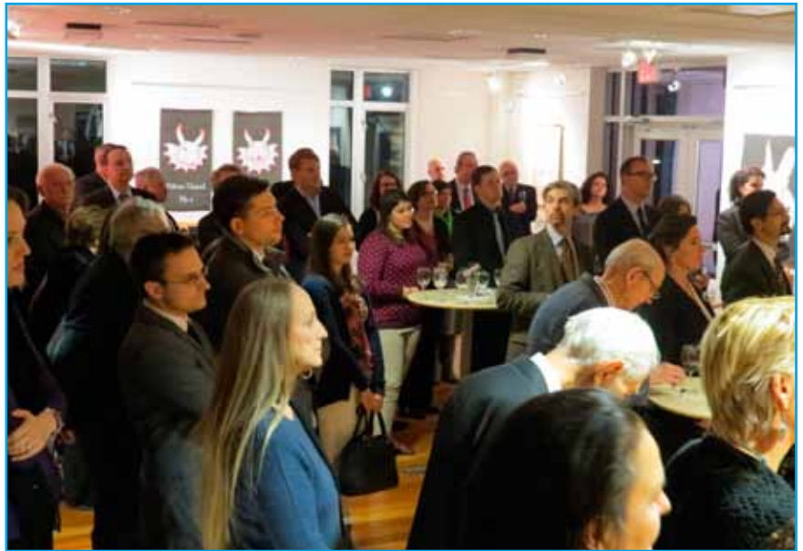
The event was attended by more than 100 guests.