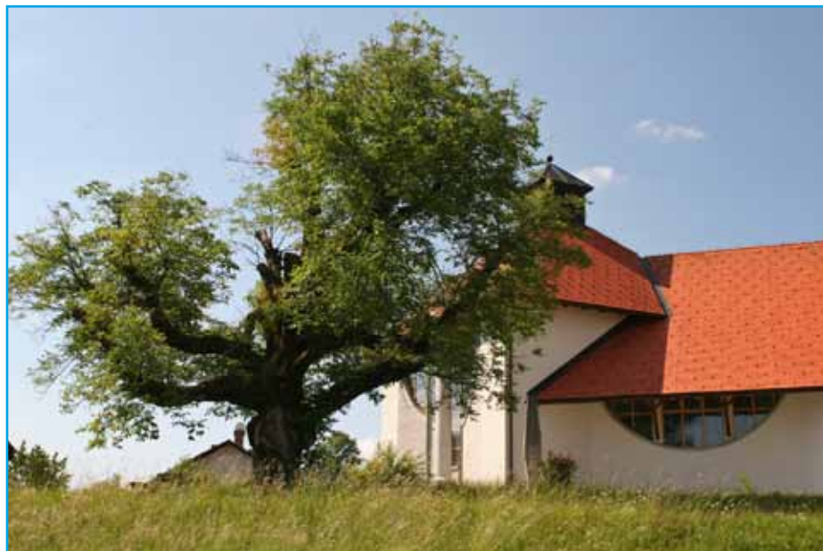
The largest walnut and the parish church of St. John the Baptist in the village of Kočevska Reka.

The Kočevje region is famous for its history. Due to the region's isolation, vast forests, harsh climate conditions, karstification, water shortage and bad land-fertility, it has been known as a deserted inaccessible jungle ever since the 13th century. In the 1330's, the Counts