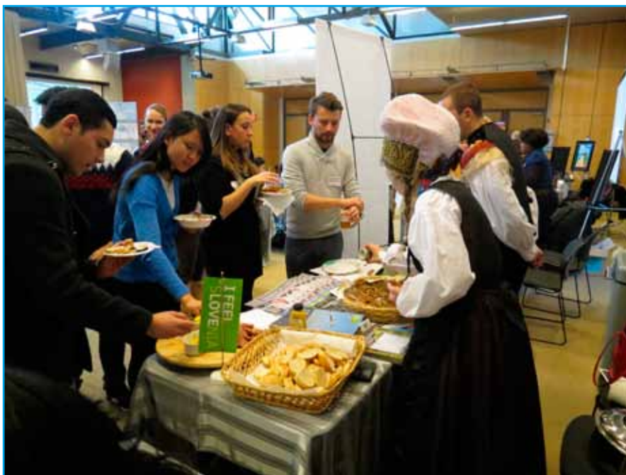
Slovenian booth was very popular among visitors.

On Friday, January 30, the Catholic University of America (CUA) for the fourth year hosted an Open House and the Embassy Exhibit event, which aimed to capture the sights, sounds, and