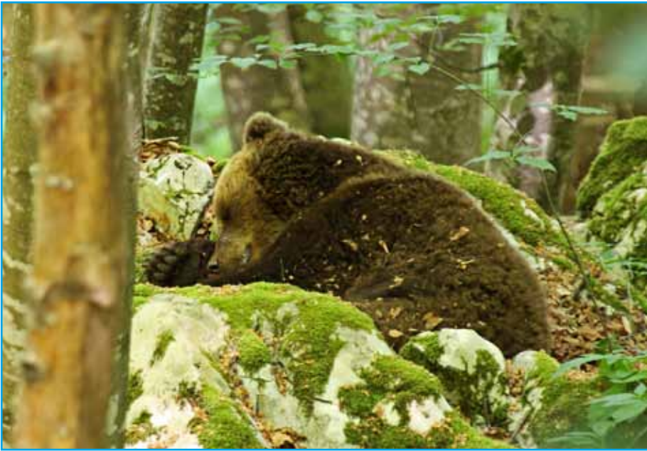
The brown bear is the most famous inhabitant of the Municipality of Kočevje.

to the nearby underground facilities and other political-military facilities. The then-closed area of Kočevska Reka covered about 180-200 sq.km. (45,000-50,000 acres) of land, which represents a quarter of the Municipality of Kočevje. It was larger than 16 of the then-existing municipalities. In the summer of 1991, the Slovenian government passed the law re-opening the closed area of Kočevska Reka.