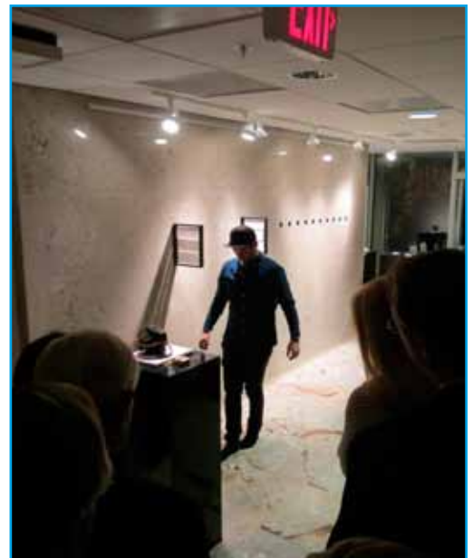
Performance: "Od tu do tu."