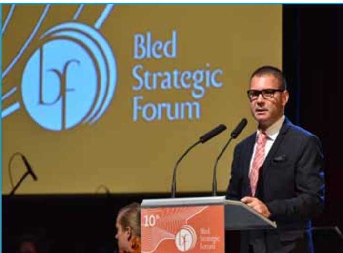
Bled Strategic Forum's Secretary General Ambassador Brian Bergant.

On the panel Strengthening the Fight against Impunity through Partnerships and Cooperation, the participants presented positive examples of strengthening international criminal justice, as many crimes are still unpunished. Special