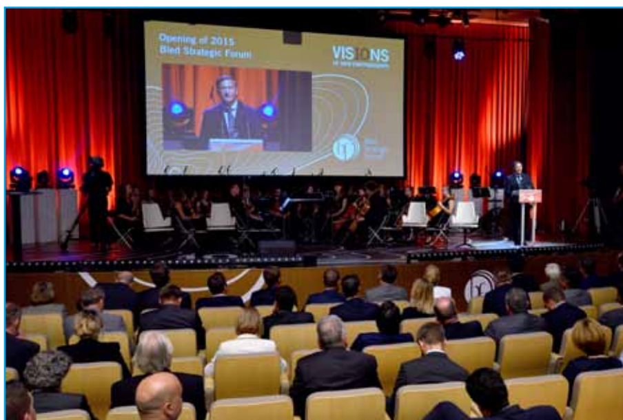
The 10th Bled Strategic Forum was organized under the title Visions of New Partnerships.

In his speech, Foreign Minister Erjavec recapitulated the history of the BSF, which in its first decade has evolved into a platform for dialogue on current topics and forged strong bonds among participants and states alike. He underlined the importance of partnerships