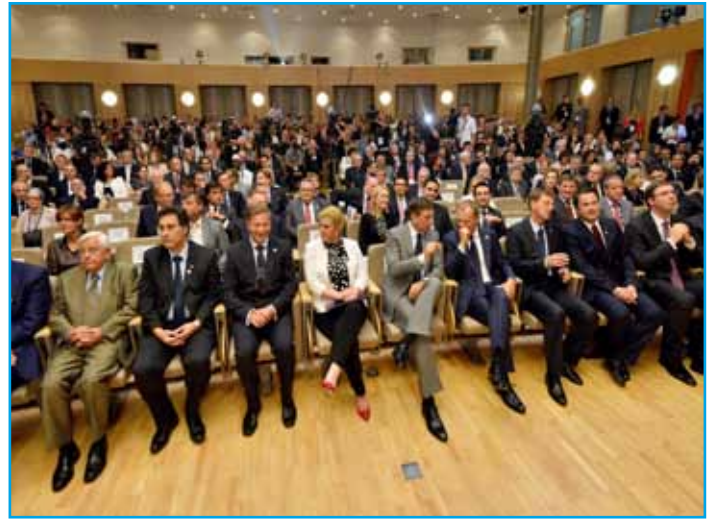
The event has brought together diplomats, entrepreneurs, NGO members, scholars and civil society activists.

by a speech by the President of the European Council, Donald Tusk. The panelists included Slovenian President Borut Pahor, Croatian President Kolinda Grabar Kitarović, Serbian Prime Minister Aleksandar Vučić, Prime Minister of Luxembourg Xavier Bettel as the incumbent EU Council President, and the OSCE Secretary General Lamberto Zannier. The panel focused on changes in the global environment and the resulting new challenges, mostly migration. In this context, they called for greater unity and coordination between European