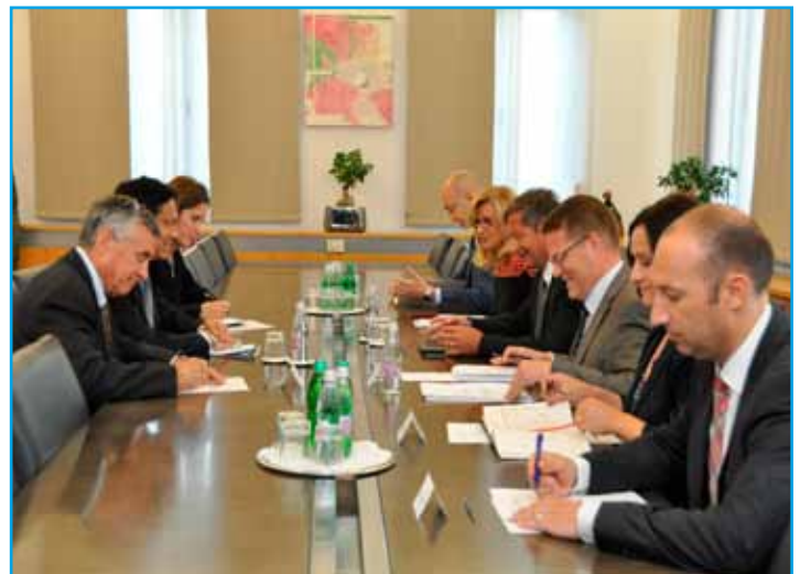
Meeting at the Ministry of Foreign Affairs.