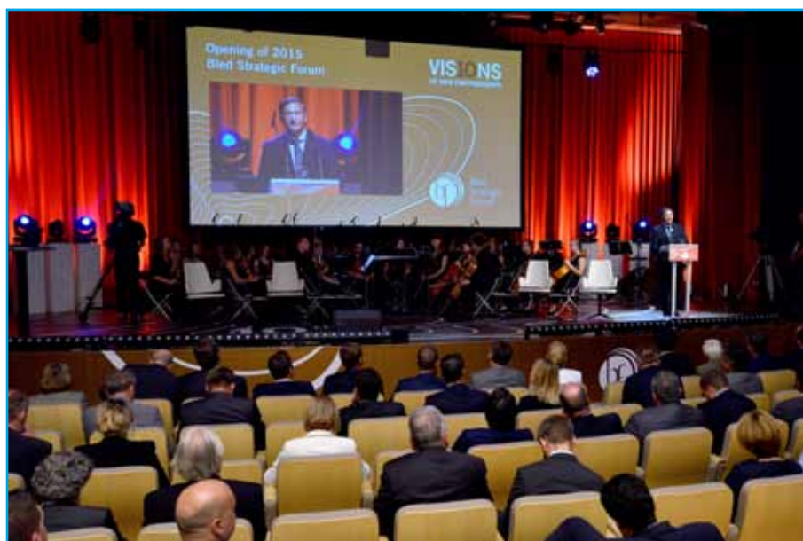
The 10th Bled Strategic Forum was organized under the title Visions of New Partnerships.

In his speech, Foreign Minister Erjavec recapitulated the history of the BSF, which in its first decade has evolved into a platform for dialogue on current topics and forged strong bonds among participants and states alike. He underlined the importance of partnerships