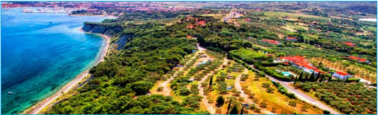
Belvedere Hotel camping in Izola

In the previous issue, we described the campsites in the Podravska and Pomurska regions, located in the northeastern part of Slovenia. This time we will travel to the opposite part of Slovenia, namely to its south-western and western part, which is commonly referred to as the Slovene Littoral (Primorska) region. The Slovene Littoral stretches from the Adriatic seacoast in the south up to the Julian Alps in the north and the Italian region Friuli-Venezia in the west. It consists of two traditional provinces, namely the Goriška and the Slovenian Istria. The Goriška region is named after the town of Gorizia (Slovene: Gorica), which is located in Italy, and the neighboring conurbation of Nova Gorica and Šempeter-Vrtojba, which are nowadays the