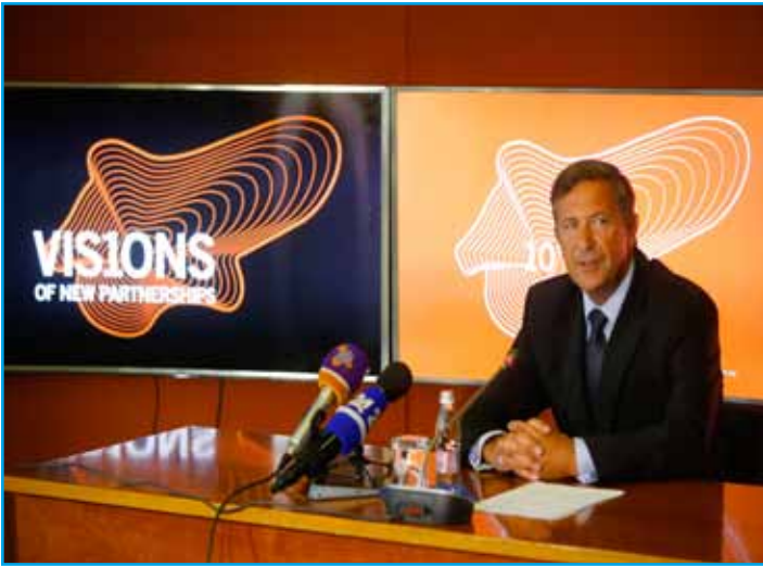
Opening remarks by Minister of Foreign Affairs Karl Erjavec.