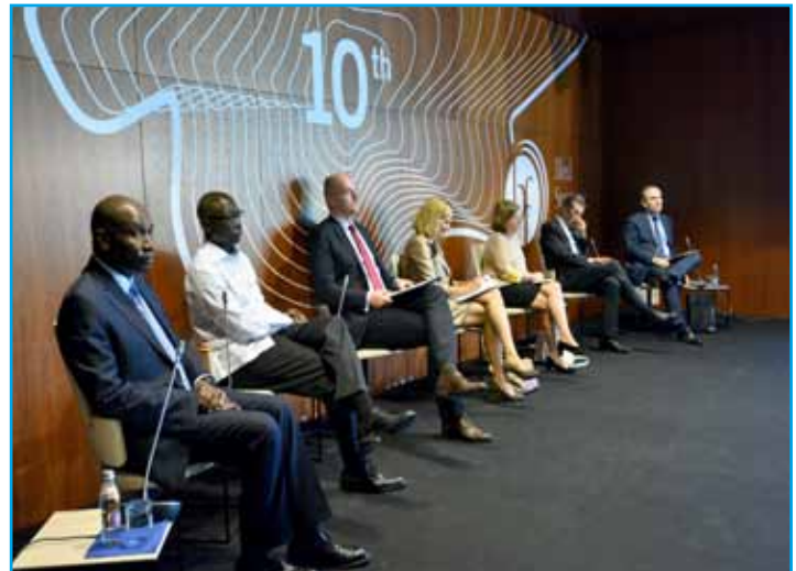
One of the BSF panel discussions.