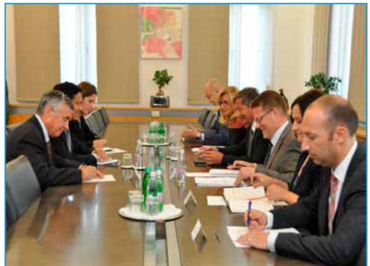
Meeting at the Ministry of Foreign Affairs.