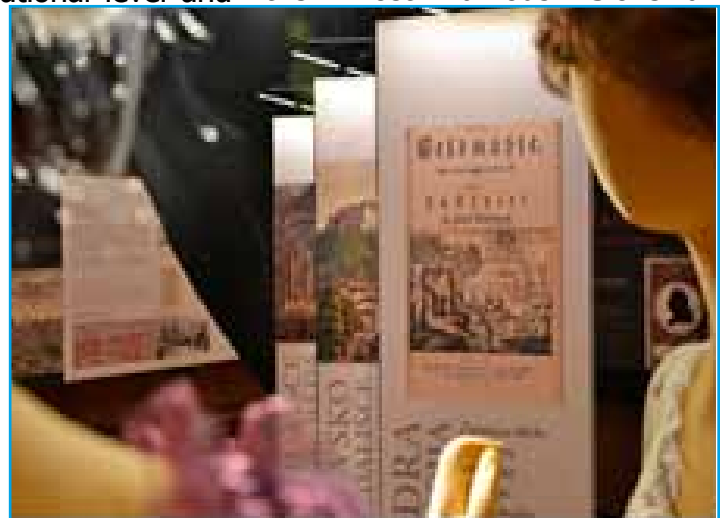
Permanent Exhibition In pursuit of a theatre. From the Jesuits to Cankar