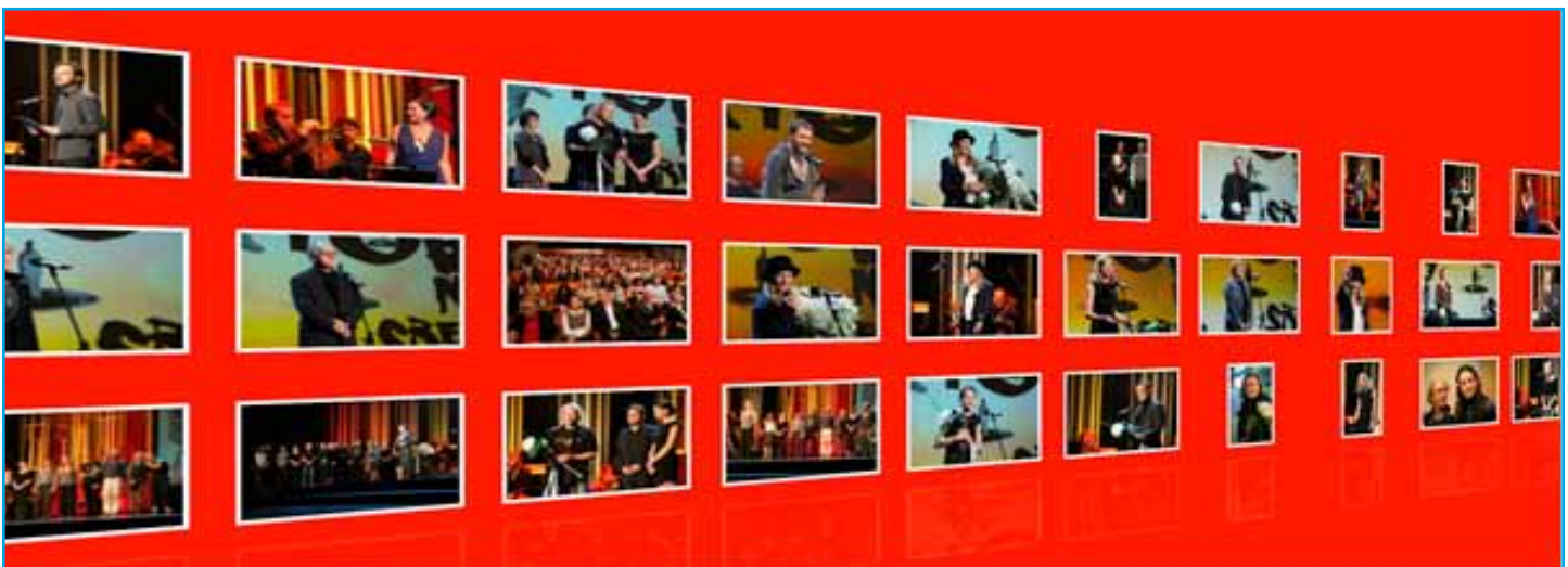
E-xhibition Maribor Theatre Festival 2013

University of Ljubljana and the Celje Historical Archives. The additional partners in the virtual e-xhibition are Novi ZATO Institute and RTV Slovenia – Radio Slovenia. The exhibition pays respect to a distinctive jubilee, brings forth the best productions of the Festival (those that have left their mark in time and were marked by time), peeks into its backstage and applauds the audience, since without them, theatre would not exist – not now, not in the past and not in the future. It strolls through the gallery of -- so far -- 45 recipients of the Borštnik Ring, the highest award for lifetime achievement in Slovene theatre, it evokes their roles, appearances and voices. The exhibition will be open through February 8, 2016.