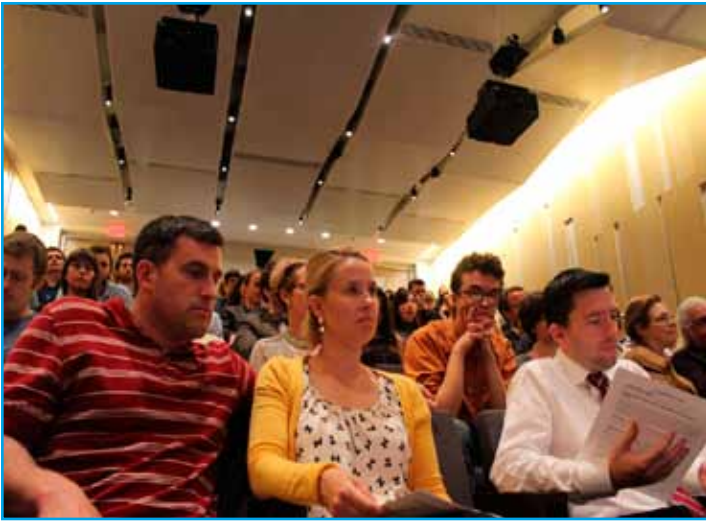
The audience at the event.