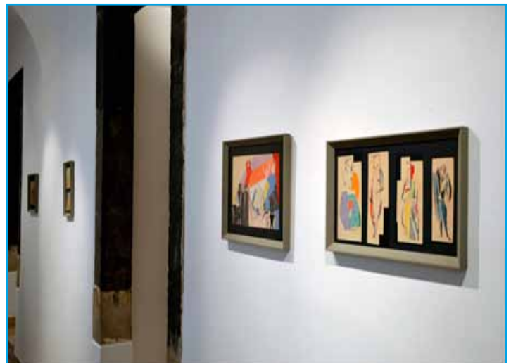
Location of the Slovenian Theatre Institute in Ljubljana's Old Town Center