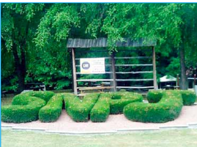
Entrance to the SNPJ Recreation Center.