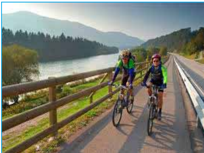
Mura Drava cycling pathway.