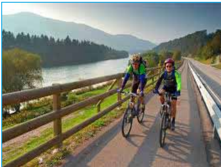
Mura Drava cycling pathway.