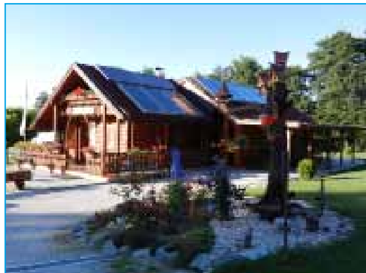
Camping Center Kekec Pohorje.

One of the terrific ways of spending holidays in Slovenia is camping. Slovenia is full of natural attractions from the Alpine region in the northwest to the Adriatic coast in the southwestern part, Pannonian flatlands in the Northeast and rolling hills in the southeast, which makes it a perfect country for camping. Slovenia is divided into twelve identifiable regions, which are marked by their own beauties and characteristics. In each of those regions can be found several campgrounds, however, the most camping areas are located in the northeastern parts of the country, namely in the Goriška and Gorenjska regions.