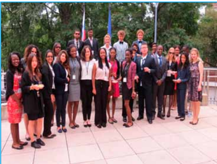
July 15 group.

The aim of the GYLC is to give students, who come from diverse ethnical and political backgrounds, a greater understanding of international relations, diplomacy, international law, human rights, peace, security, economics and the role of the United Nations. They come to Washington from a variety of countries to take part in this program, which gives them a unique approach to leadership training.