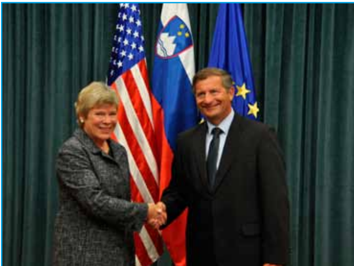
With MFA Karl Erjavec.