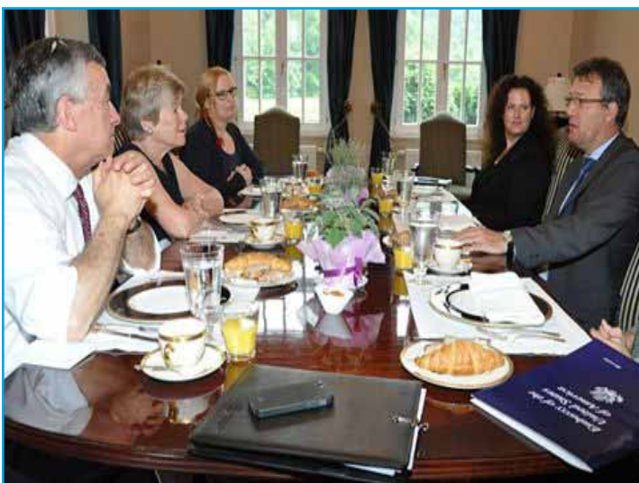
ITF presented its activities during the working breakfast with at the U.S. Embassy Ljubljana