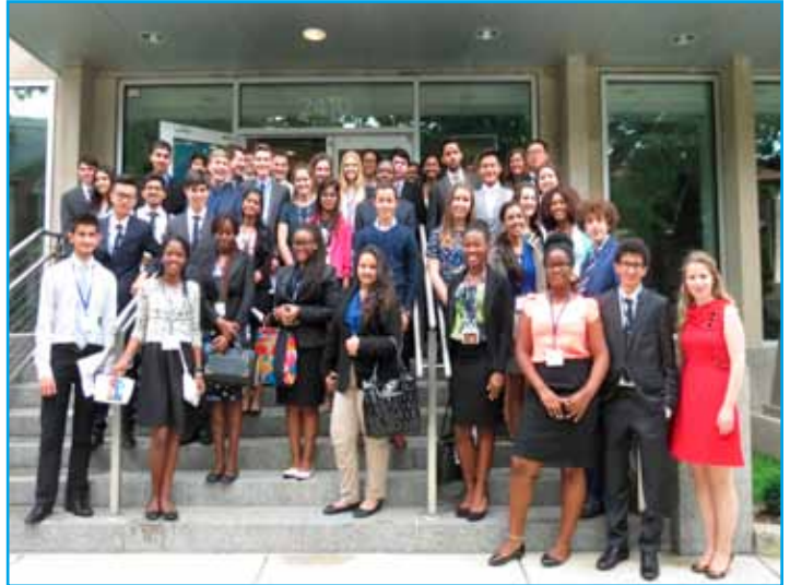
July 8 group.