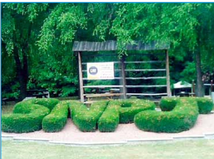
Entrance to the SNPJ Recreation Center.