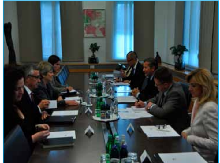
Both sides expressed concern over new forms of terrorism, especially radicalization.

On July 12–13, U.S. Under Secretary of State for Arms Control and International Security Rose E. Gottemoeller visited Ljubljana, where she met with President Borut Pahor, Foreign Minister Karl Erjavec, and other counterparts at the Ministry of Foreign Affairs.