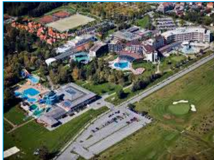
Moravske Toplice natural health resort.