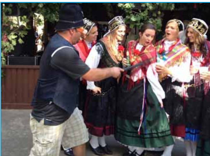
Slovenian community celebrating the grape harvest.