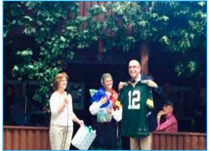
"Vinska trgatav" picnic at Triglav Park.