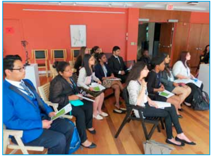
The students came to the U.S. from around the globe.