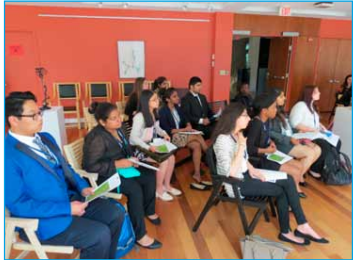
The students came to the U.S. from around the globe.