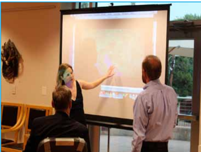
Presentation of Slovenia.