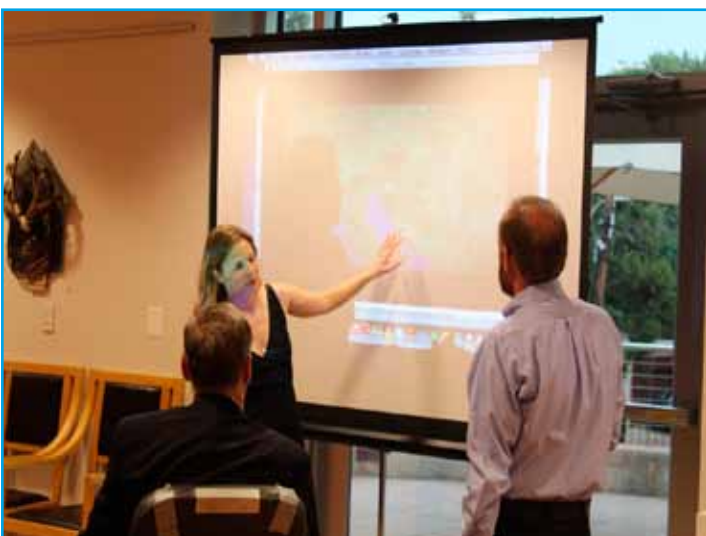
Presentation of Slovenia.