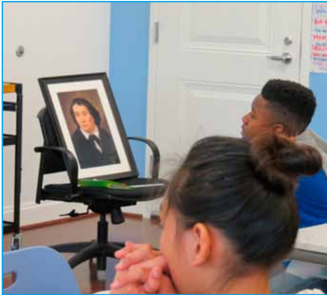
Students learned about Slovenian poet France Prešeren.