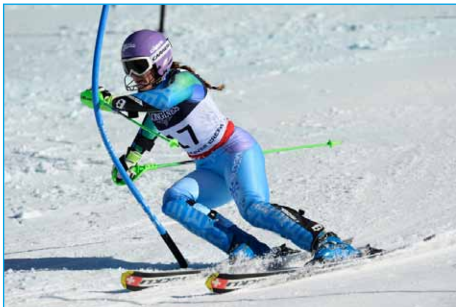
Tina's alpine combined action in Vail-Beaver Creek.

Maze is the recipient of numerous awards and titles. A five-time Slovenian Female Athlete of the Year, she was named the World Sportswoman of the Year by Gazzetta dello Sport in 2014 and European Athlete of the Year by European Press Agencies in 2013. She has been nominated for the Laureus World Sports Award for Sportswoman of the Year in 2014 and is in the running again this year. Having won nine World Championship medals makes Maze the most successful active skier and one of the top ten female skiers ever. She became only the second skier ever to win gold in downhill at both the Olympics and the World Championship.