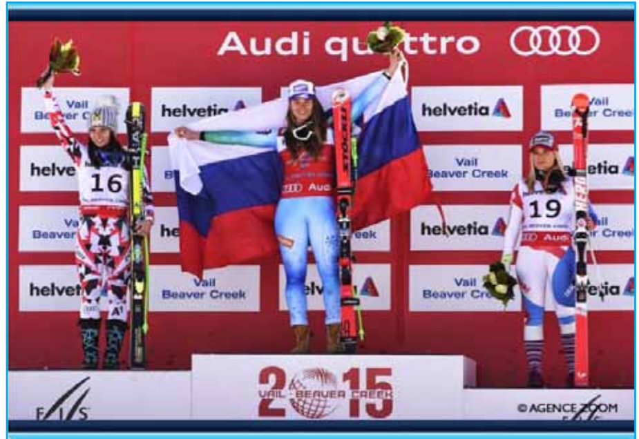
Tina on the top with a Slovenian flag after winning in the downhill race.

Tina also grabbed gold in the super-combined event on Monday, February 9. Clocking a combined time of 2:33.37, the 31-year-old finished 0.22 seconds ahead of the second-placed Nicole Hosp of Austria. Michaela Kirchgasser was 0.35 seconds adrift in third. Tina finished fifth in giant slalom race and closed by taking eighth place in slalom at the World Championships in Beaver Creek.