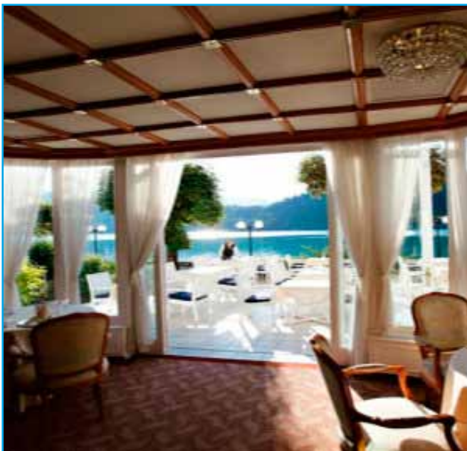
Grand Hotel Toplice in Bled.

With immense natural beauty, Bled, together with its surroundings, ranks among the most beautiful alpine resorts, renowned for its mild, healing climate and thermal lake water. The beauty of the mountains reflected on the lake, the sun, the serenity and the fresh air arouse pleasant feelings in visitors throughout