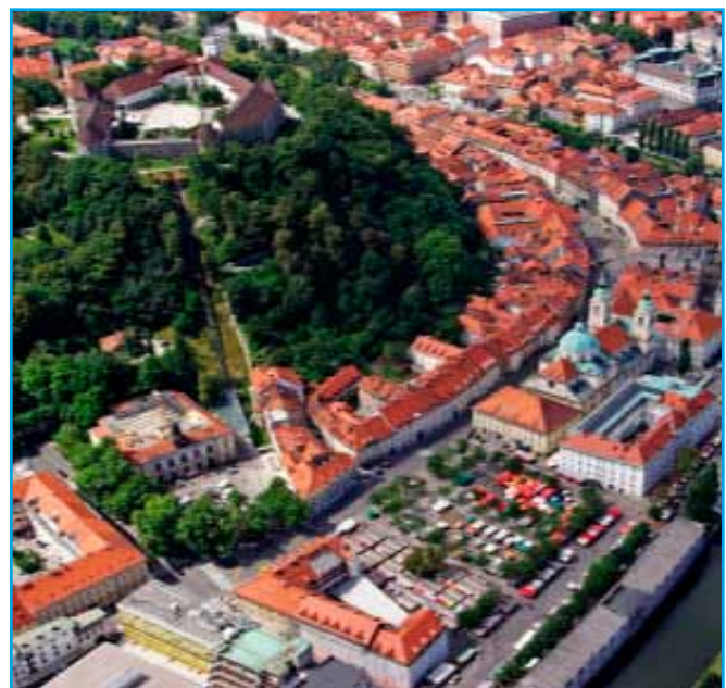
Ljubljana - old town.