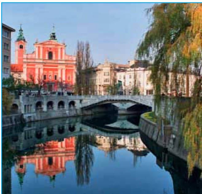
Ljubljana - three bridges.

of two very different but complementary features: on the one hand, the city is famed for its historical heritage and traditions; on the other, it is a relatively young city with a modern lifestyle (the average