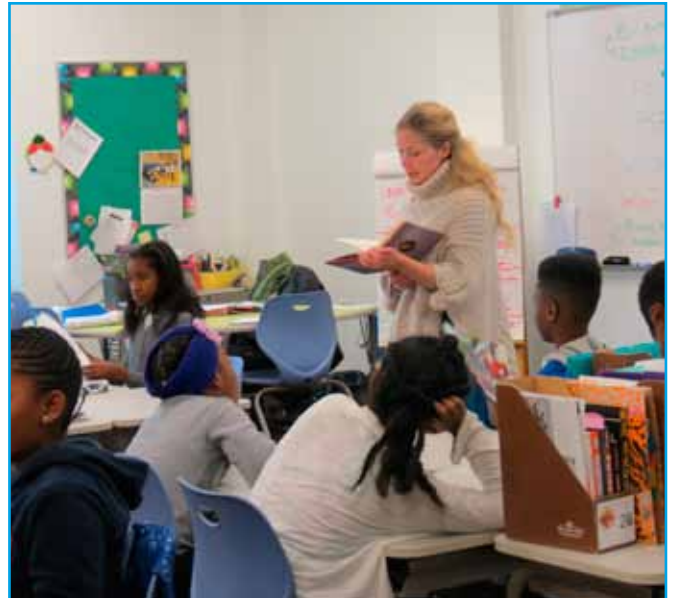
Reading the first Slovene ballad "The Water Man" (Povodni mož).