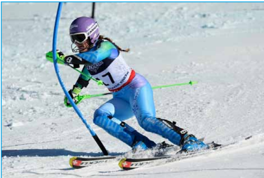
Tina's alpine combined action in Vail-Beaver Creek.

Maze is the recipient of numerous awards and titles. A five-time Slovenian Female Athlete of the Year, she was named the World Sportswoman of the Year by Gazzetta dello Sport in 2014 and European Athlete of the Year by European Press Agencies in 2013. She has been nominated for the Laureus World Sports Award for Sportswoman of the Year in 2014 and is in the running again this year. Having won nine World Championship medals makes Maze the most successful active skier and one of the top ten female skiers ever. She became only the second skier ever to win gold in downhill at both the Olympics and the World Championship.