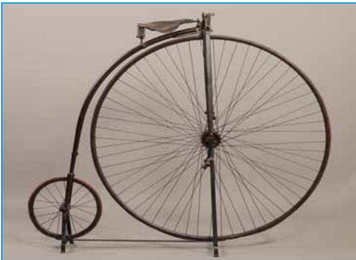
In 1883, the Bicycle Club was founded in Maribor; already a year later a bicycle race from Maribor to Ptuj was took place. Due to the increasing number of cyclists, the city council issued regulations for riding bicycles on city streets in 1887.

The extensive furniture collection is exhibited in the depot warehouses. The collected furniture dates back to 1500 and through the first half of the 20th century, and was used in castles, mansions, middle class houses, as well as peasant houses in the regions of Styria, Carinthia and