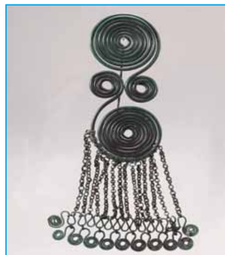
Bronze fibula, 10th–8th century BC, Pobrežje, Maribor

equipment for the salesroom of a pharmacy, and laboratory equipment. Most of the artefacts have been acquired from former pharmacies in Maribor as well as other pharmacies in the regions of Styria, Prekmurje and Carinthia. We also came across objects that were used in the monastic pharmacy in Olimje, the oldest pharmacy in Slovenia. Text by: Drago Oman