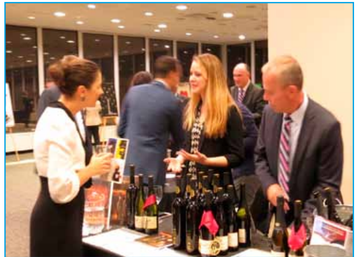
The event featured presentation of Slovenian wine and Laureate Imports. tourism.