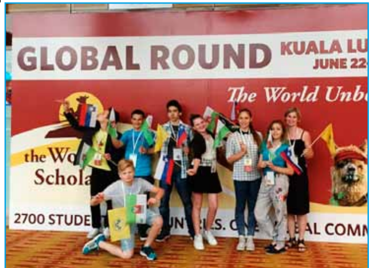
Qualifying Global round in Kuala Lumpur.