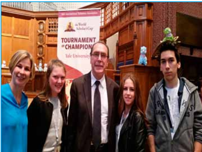
The ambassador with the Slovenian team.