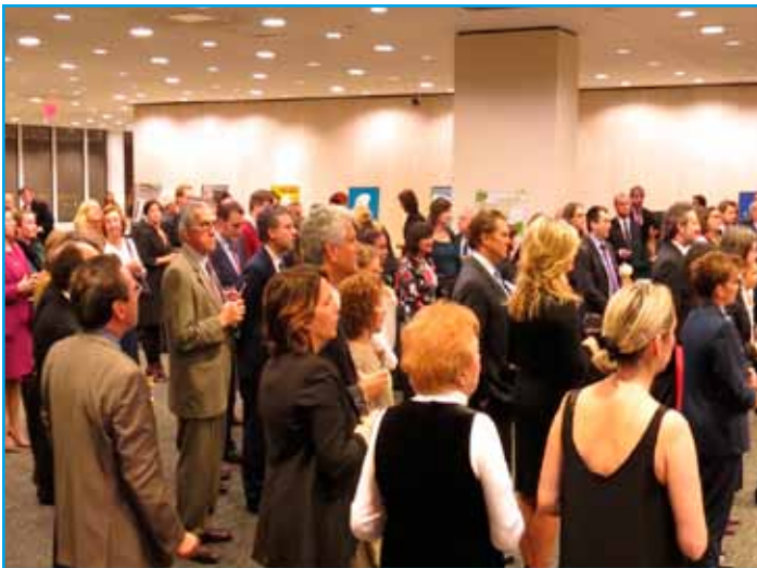
Around 200 guests attended the opening ceremony.