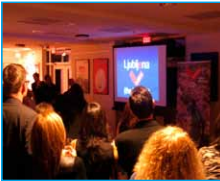
Presenting Ljubljana with IDCD.

As is traditional, the Embassy of Slovenia hosted on first Friday of October the annual meeting of the consul