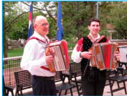
E.U. Open House.

displayed on the embassy premises by the SNPJ Heritage Museum from Pittsburgh, PA. Slovenian Union of America (SUA) members conducted an online class of Slovene, exhibited traditional beehive