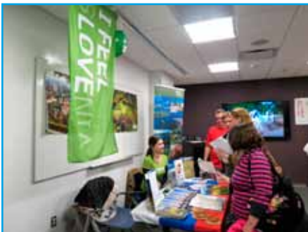
G-fest at NYU.