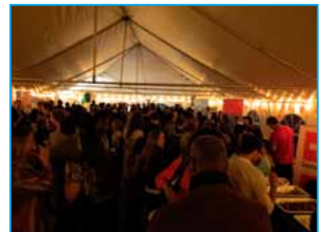
La Grande Fête de la Francophonie.

On March 20, 2014, Colorado National Guard leadership paid their annual visit to the Slovenian embassy. On March 21, the Embassy of Slovenia presented the