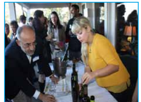
Wine tasting in Knoxville, TN.