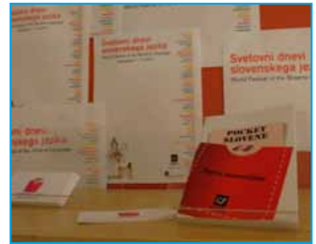
World Festival of the Slovene Language.

The Ministry of Foreign Affairs hosted on December 10 in Ljubljana the seventh regular annual political and security