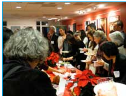
The Fulbright alumni reception.

On December 5, evening, the Embassy of Slovenia hosted the annual holiday reception for the Washington, DC, chapter of the University of Minnesota