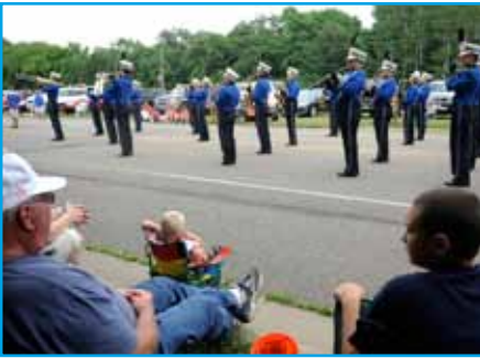
Celebration in St. Stephen, MN.

the crisis in Iraq at a Beyond the Headlines event at the Embassy of Slovenia. The event was organized in collaboration with the Women's Foreign Policy Group.