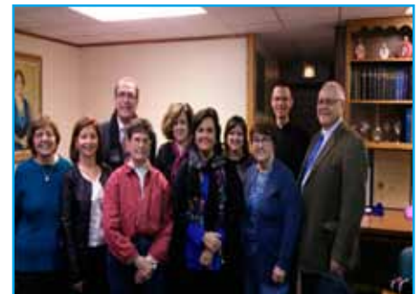
The ambassador visiting SUA headquarters in Joliet, IL.