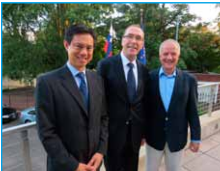
National Day celebration.