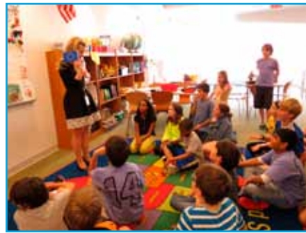
Learning about Slovenia in the E.U.