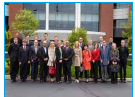
Business delegation to OH and PA.

In collaboration with the International Club of DC, the Embassy of Slovenia hosted on Friday, May 23, an evening event that featured cultural, business and culinary offerings of Slovenia. Also held at the