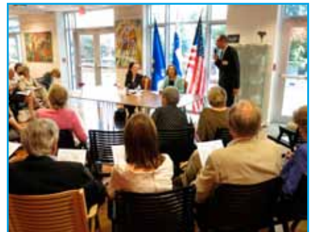
Women Foreign Policy Group event.