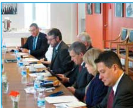
Annual meeting of honorary consuls.