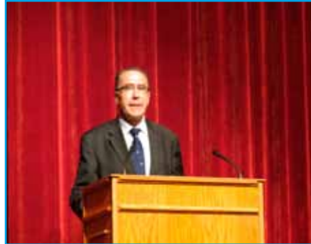
The ambassador lectures on ICC at the Salisbury University.

Between September 10 and 15, Theremidi Orchestra (TO) held in New York a workshop on basic usage of electronics to create