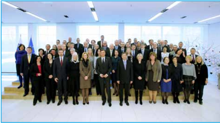
On the second day of the consultations, the heads of diplomatic missions and consular posts were addressed by the Slovenian President, Borut Pahor, and on Wednesday, also by the President of the National Assembly, Dr. Milan Brglez.

crucial for protecting the rights of the Slovenian minority in Austrian Carinthia and Styria. The minister stressed that relations with neighbors are a vital priority of each country. "I note with pleasure that our bilateral relations are positive, without major outstanding issues, and that all other issues are being resolved through constructive dialogue," he explained. Slovenia's foreign policy will continue to focus on its place and role in Central Europe, including regional integration, which is increasing in strength and importance also in the EU.