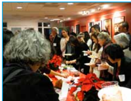
The Fulbright alumni reception.

On December 5, evening, the Embassy of Slovenia hosted the annual holiday reception for the Washington, DC, chapter of the University of Minnesota