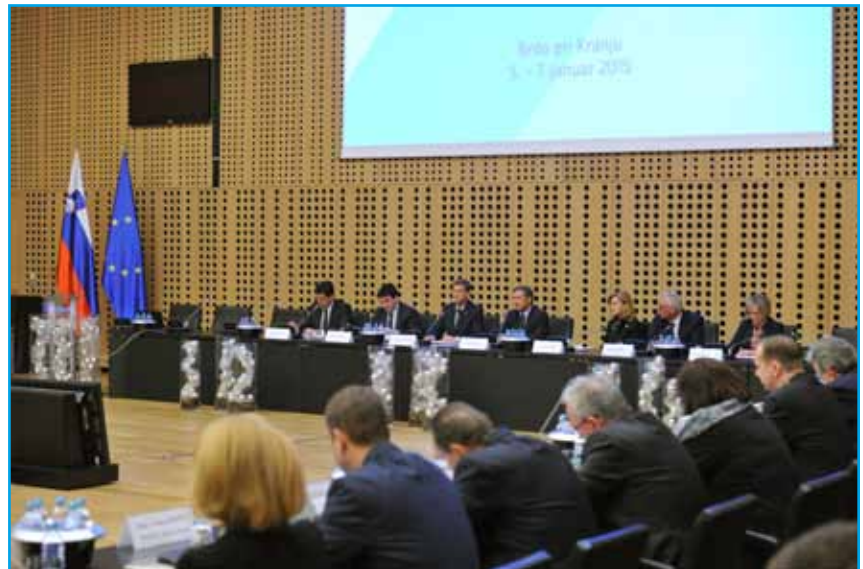
Discussion with the Slovenian Prime Minister, Dr. Miro Cerar and Minister of Foreign Affairs, Mr. Karl Erjavec.

He mentioned that, in 2015, the international community, including Slovenia, is marking the anniversaries of some important milestones in the development of international relations. The First World War centenary commemorations continue; this year will also mark seventy years since the end of Second World War, seventy