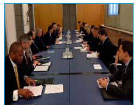
Political and security consultations.

In the program of the 27th annual AFI European Union Film Showcase, which traditionally takes place at the historic AFI Silver Theatre in Silver Spring, Maryland, and this year ran from December 3 through December 21, Slovenian film "Class Enemy"