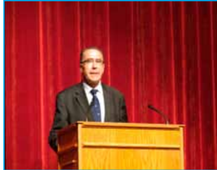
The ambassador lectures on ICC at the Salisbury University.

Between September 10 and 15, Theremidi Orchestra (TO) held in New York a workshop on basic usage of electronics to create