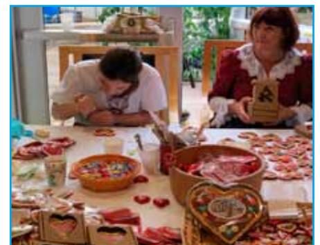
E.U. Open House.

On May 1, Slovenia marked the 10th anniversary of its accession to the European Union, alongside with Poland, Latvia, Lithuania, Czech Republic, Slovakia, Estonia, Hungary, Cyprus, and Malta.