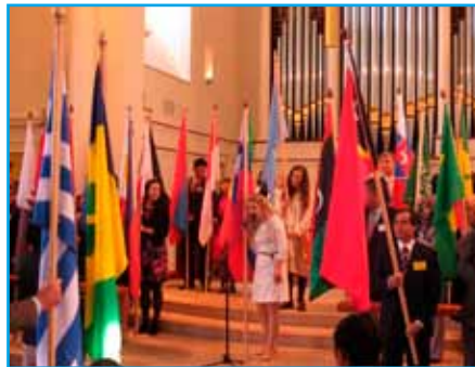
U.N. Day celebration.