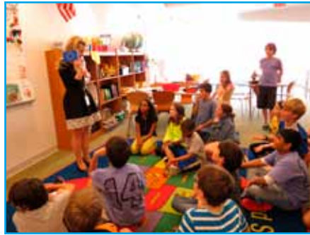
Learning about Slovenia in the E.U.