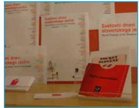
World Festival of the Slovene Language.

The Ministry of Foreign Affairs hosted on December 10 in Ljubljana the seventh regular annual political and security