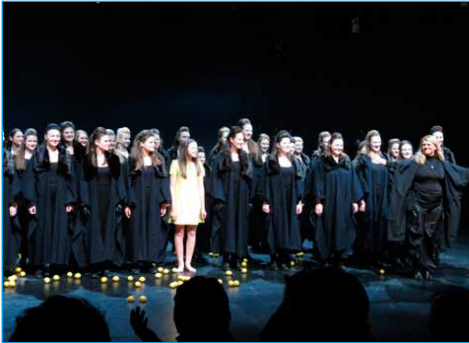
The ensemble and the conductor Karmina Šilec after the first show.

The internationally acclaimed Slovenian girls' choir Carmina Slovenica, presented its new project "Toxic Psalms: Ultimate Collective Experience" to the North American public at a festival in New York between January 8 and 11.