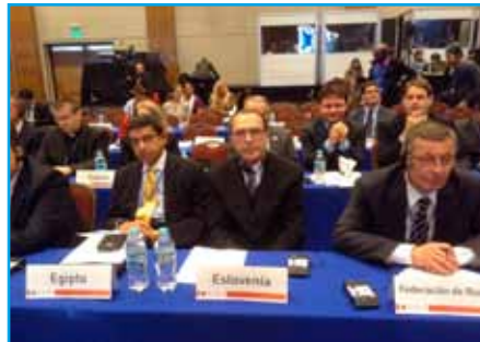
Ambassador in Paraguay.

in Southeast Washington. The event was organized and hosted by the Communities in Schools of the Nation's Capital. Slovenia was also represented at the Murch Elementary School's International Night. In