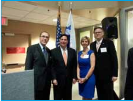
Opening of the consulate in Pittsburgh.