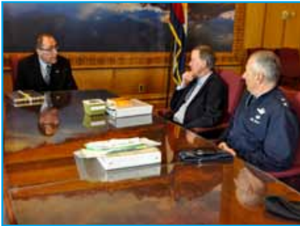
The ambassador's visit to Colorado.

Musicians, composers, and members of the local New York Slovene community gathered in Williamsburg, NY, for a concert, titled Dialogues,