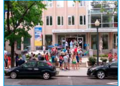
EU Open House.

and the fair of nations, where Slovenia's artifacts, brochures, touristic spotlights and food were presented. At the end of April, the embassy hosted a performance of Mendelssohn's Piano trio concerto, and for