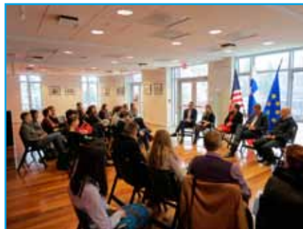
Ljubljana School of Law students visiting the embassy.

services in San Francisco on March 24. On the same day, the U.S. Chamber of Commerce hosted in Washington the event »Central Europe: Innovative and Open for Business«, focusing on the wide range of commercial opportunities in the Czech Republic, Hungary, Poland, Slovakia, and Slovenia. On March 25, a group of law students from the University of Ljubljana,