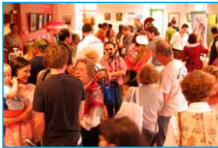
E.U. Open House.