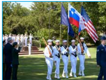
Flag raising in Norfolk, VA.

Celebrations to mark June 25, when in 1991 the Slovenian Assembly passed the Basic Constitutional Charter and the Declaration of Independence, were held also in Cleveland, OH, Bethlehem, PA, Norfolk, VA, St.