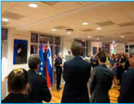
The ASEF East Coast Chapter Inaugural Event.