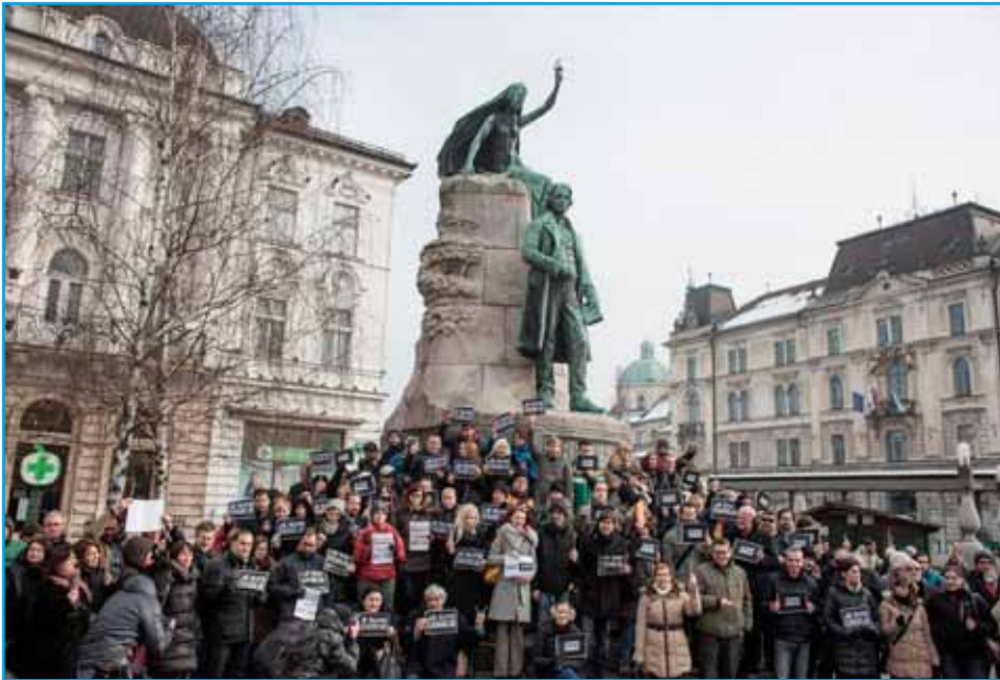
About 200 people, mostly journalists and politicians, turned up for the rally in the capital city, which, like the event in Maribor, was organized by the Slovenian Association of Journalists .