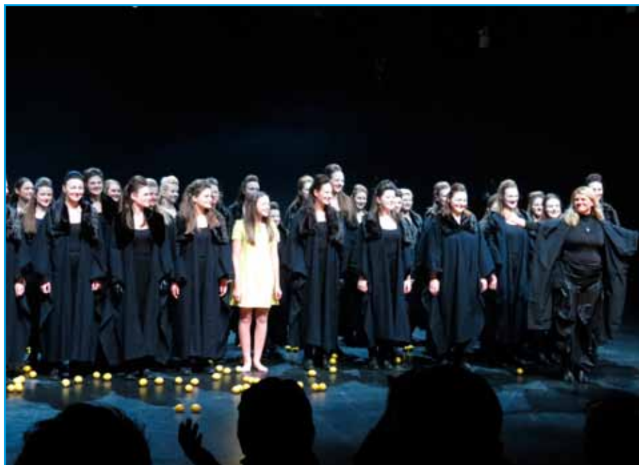
The ensemble and the conductor Karmina Šilec after the first show.

The internationally acclaimed Slovenian girls' choir Carmina Slovenica, presented its new project "Toxic Psalms: Ultimate Collective Experience" to the North American public at a festival in New York between January 8 and 11.