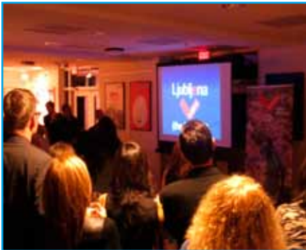
Presenting Ljubljana with IDCD.

As is traditional, the Embassy of Slovenia hosted on first Friday of October the annual meeting of the consul