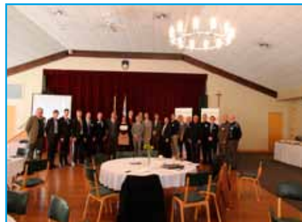
Business conference in Chicago, IL.

Društvo v tujini izobraženih Slovencev - VTIS (Association of Slovenes Educated Abroad) organized an event in New York, which was part of the global series "Slovene Science Around the World". The event took place