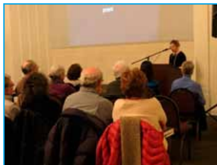
Documentary about Boris Pahor was presented in Annapolis, MD.