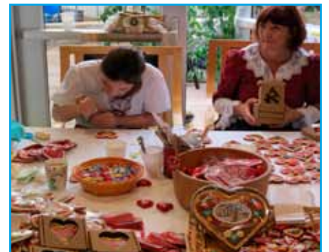
E.U. Open House.

On May 1, Slovenia marked the 10th anniversary of its accession to the European Union, alongside with Poland, Latvia, Lithuania, Czech Republic, Slovakia, Estonia, Hungary, Cyprus, and Malta.