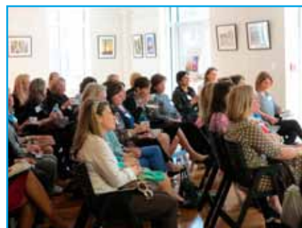
Women Diplomatic Series event.