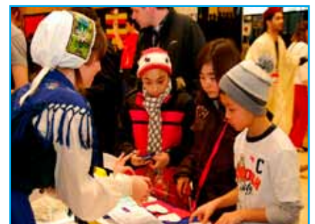
CulturalFest in Seattle, WA.