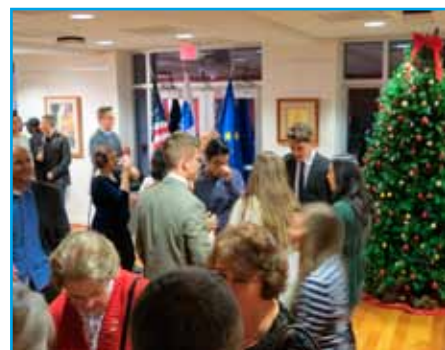
Independence and Unity Day Reception.

Those are only a few highlights of Slovenia's presence in the U.S. in the year 2014. We are looking forward to new challenges in 2015!