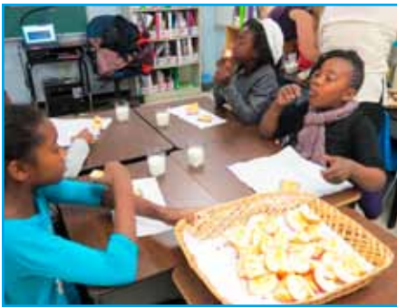
Traditional Slovenian breakfast.

The Society for Slovene Studies (SSS), an organization of international scholars interested in Slovenia, had its annual meeting at the ASEES (Association for Slavic, East European and Eurasian Studies) convention November 20-23, 2014 in San Antonio, Texas. U.S. astronauts of Slovenian ancestry Ms. Sunita Williams and Ronald Šega visited Slovenia in October and November respectively.