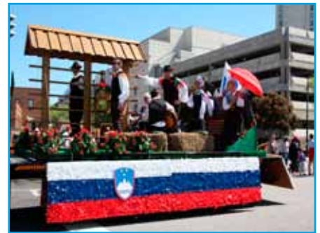
NATO Fest in Norfolk took place in April.