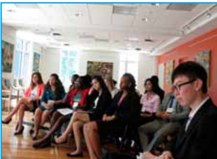
Participants of Global Young Leaders Conference at the embassy.

On Sunday, July 13, Slovenia held early parliamentary elections of the 90 deputies to the National Assembly. On July 17, Slovenia joined the marking of the 16th anniversary of the adoption of the Rome Statute of the International Criminal Court. As a Party to the Rome Statute,