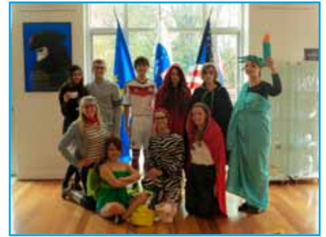
Trick-or-treating at the embassy.