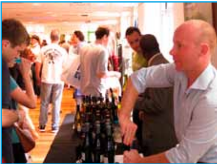
E.U. Open House.

Around 4000 people visited the Slovenian embassy on Saturday, May 10, 2014, for the annual open house. The