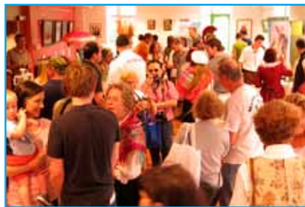
E.U. Open House.