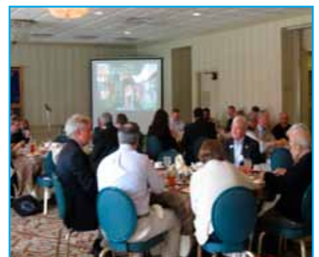
Bethesda-Chevy Chase Rotary Club event.

As part of the Embassy Adoption Program, the Embassy of Slovenia for the sixth year "adopted" a school class. This year, the embassy has bonded with the fifth graders of the Hearst Elementary School in Northwest Washington. On Sunday, October 26, the embassy participated in an AIESEC DC Global Village event, which took place at the George Washington University Yard. Slovenia was also represented at the Washington National Cathedral School's International