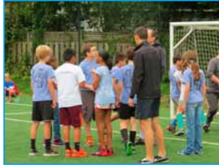
Soccer match with Janney ES.

The Embassy of Slovenia participated in a Multicultural Fair that took place on May 29 at Garfield Elementary School