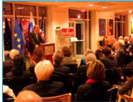
Briefing for Harvard Club of D.C.

audience. On November 3, the exhibition was opened on the premises of the Pellissippi University. On November 7, American-Slovenian Education Foundation presented an