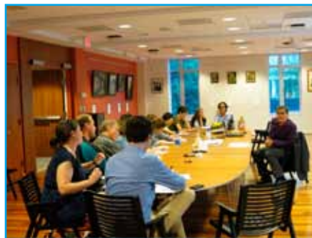
Slovene language class.

panels and other traditional items. The visitors could also admire Rogaška crystal and Idria lace, and get tourist information. Children could listen to traditional Slovenian