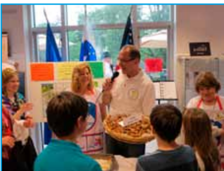
E.U. Open House. E.U. Open House.

The visitors could also view original household items, artwork and implements