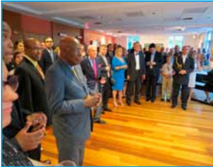
National Day celebration.

The Ambassador of the Republic of Slovenia, Dr.