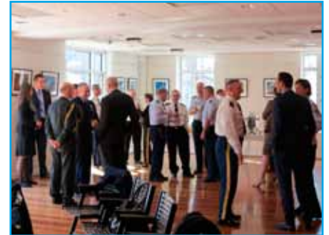
Colorado National Guard visit.