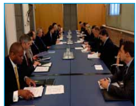
Political and security consultations.

In the program of the 27th annual AFI European Union Film Showcase, which traditionally takes place at the historic AFI Silver Theatre in Silver Spring, Maryland, and this year ran from December 3 through December 21, Slovenian film "Class Enemy"