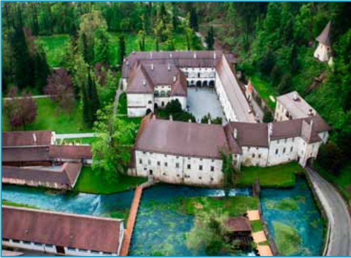
Technical Museum of Slovenia