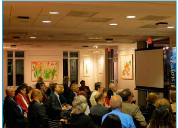
Around 60 guests attended the event.