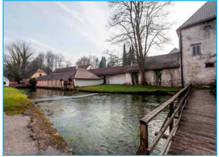
TMS is located in Bistra near Vrhnika.

What better way to learn about Slovenia's history, art and heritage than by visiting various museums spread throughout the country? When making a list of things to do in Slovenia, do not forget about interesting galleries and museum collections. We will do our best to introduce as many as possible in our newsletter.