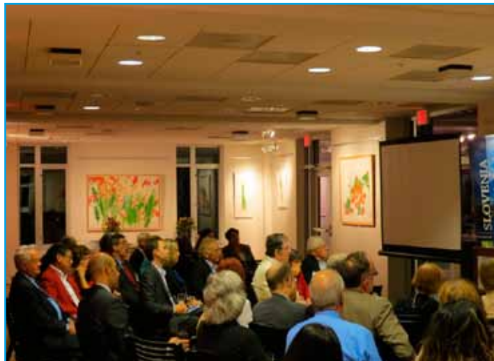
Around 60 guests attended the event.