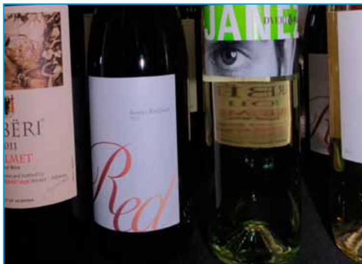
Janez, cuvée 2013 and Benedict RED, cuvée 2011.

Organized by Winebow Imports DC, the 2nd Annual Vintner's Harvest for trade and press representatives took place on the rooftop restaurant of the John F. Kennedy Center for the Performing Arts on Monday September 14. This year's well-attended event featured, among others, Slovenian wines