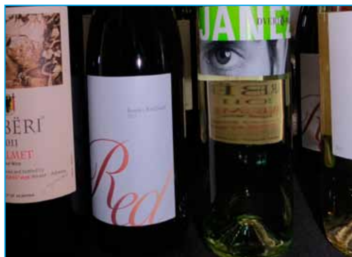
Janez, cuvée 2013 and Benedict RED, cuvée 2011.

Organized by Winebow Imports DC, the 2nd Annual Vintner's Harvest for trade and press representatives took place on the rooftop restaurant of the John F. Kennedy Center for the Performing Arts on Monday September 14. This year's well-attended event featured, among others, Slovenian wines