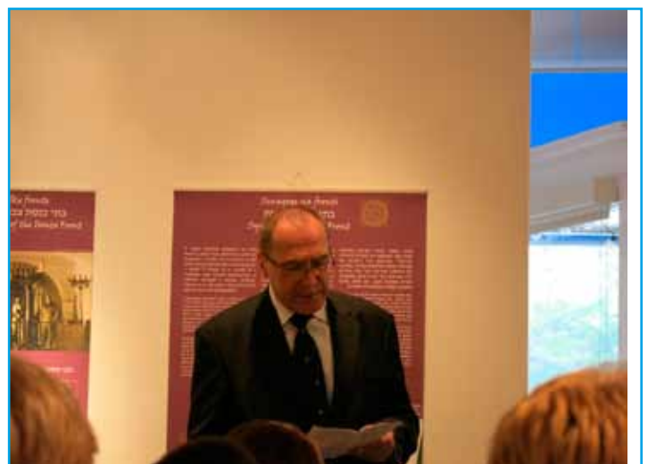
Opening of the WWI exhibition.