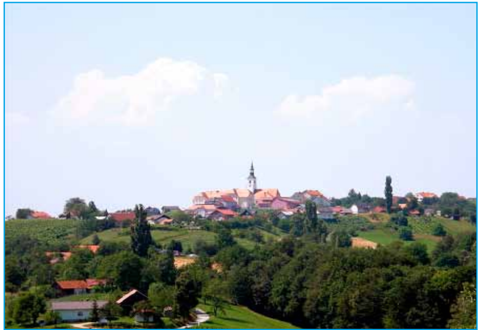
Distinctive panorama of Destrnik.

Some time around 1100, the Counts of Szekeli erected a