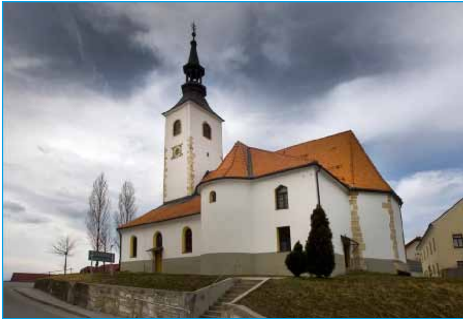
The church of St. Urban.

Destrnik has been for some time seeking investors for a project called Terme Gaja. A few years ago, in an area of abandoned clay pits, thermal water was discovered. At that time, the idea of a large tourist project was conceived, but did not progress due to inability to obtaining financing. The main proponents of the development of tourism are still looking for investors to build the tourist complex.