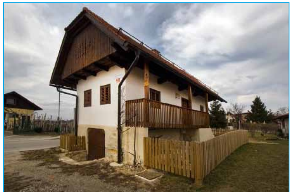
Viničarija – winegrower's cottage.

TOURISM SOCIETY OF DESTNIK, Destrnik 9, 2253 Destrnik, Slovenia; e-mail: tddestrnik@gmail.com