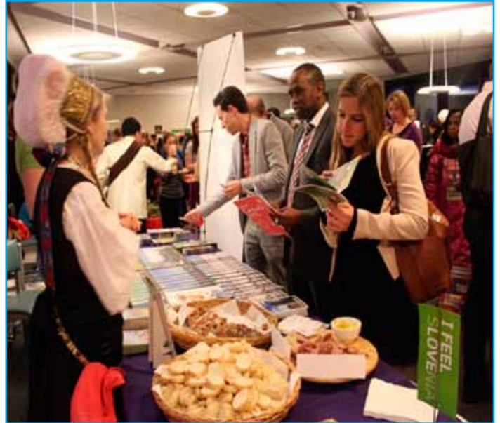
Guest could taste Carniolian sausages and potica.