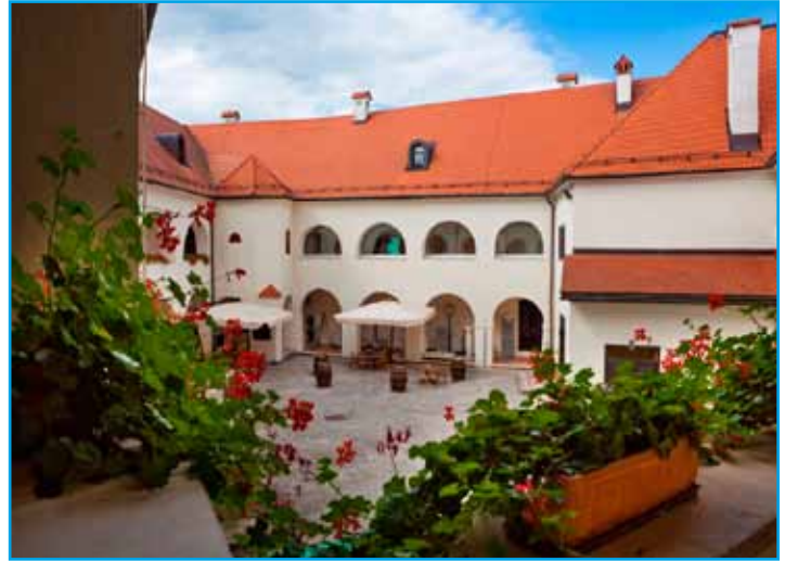
The Metlika castle's courtyard.

What better way to learn about Slovenia's history, art and heritage than by visiting various museums spread throughout the country? When making a list of things to do in Slovenia, do not forget about interesting galleries and museum collections. We will do our best to introduce as many as possible in our newsletter.