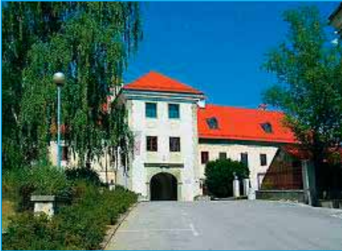
The permanent display in the Metlika castle.