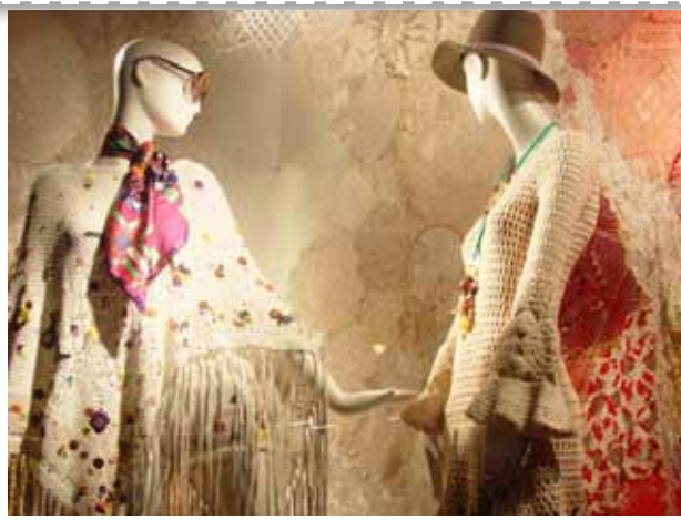
An art intervention by Eva Petrič.