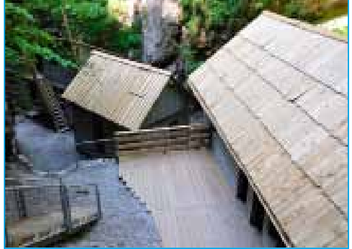
Washrooms and care facility.

What better way to learn about Slovenia's history, art and heritage than by visiting various museums spread throughout the country? When making a list of things to do in Slovenia, do not forget about interesting galleries and museum collections. We will do our best to introduce as many as possible in our newsletter.