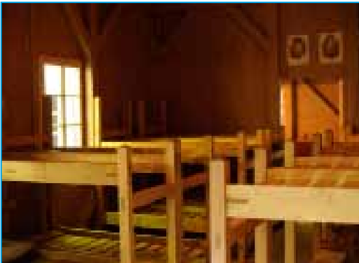
Cabin for the wounded.

The access path to the hospital ran along the Čerinščica. Before being transported -- which took place at night -- the wounded were blindfolded to ensure they could not see and reveal where they were treated. This was the only clandestine partisan hospital that set up its own defense system. Although the enemy came twice into the immediate vicinity of the hospital, it was never discovered. The hospital facility in the gorge was intended