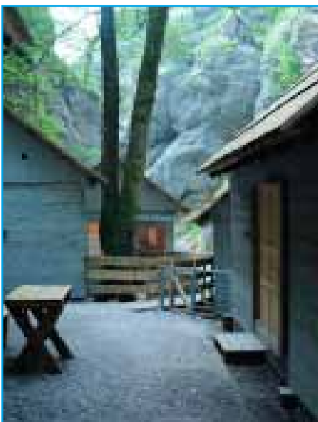
In front of the dining room.

Franja Hospital is a cultural monument of national importance, entered in UNESCO's Tentative List of World Heritage. Because of a flood, the hospital was almost entirely destroyed in 2007, but soon thereafter was completely reconstructed. Due to its symbolic value and its role in the European history and culture, Partisan hospital Franja received the European heritage label in 2015. Franja is a unique example of providing healthcare in adverse circumstances and is also a symbol of humanity, solidarity and comradeship among local people, hospital staff members and wounded soldiers, who fought against fascism and nazism in World War II.