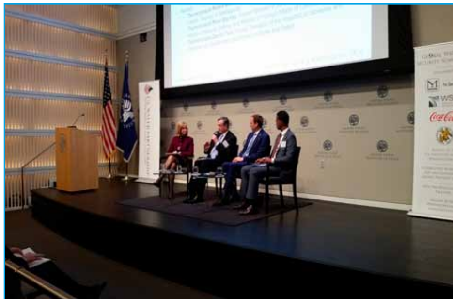
Former President of Slovenia, Dr. Danilo Türk, actively participated at the Global Water Security Summit, which took place March 22 at the United States Institute of Peace.

Until a year ago, serious tensions were mounting in northeastern Africa. Egypt, Sudan and Ethiopia confronted each other over the Grand Ethiopian Renaissance Dam on the border between Ethiopia