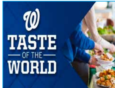
Taste of the World event.