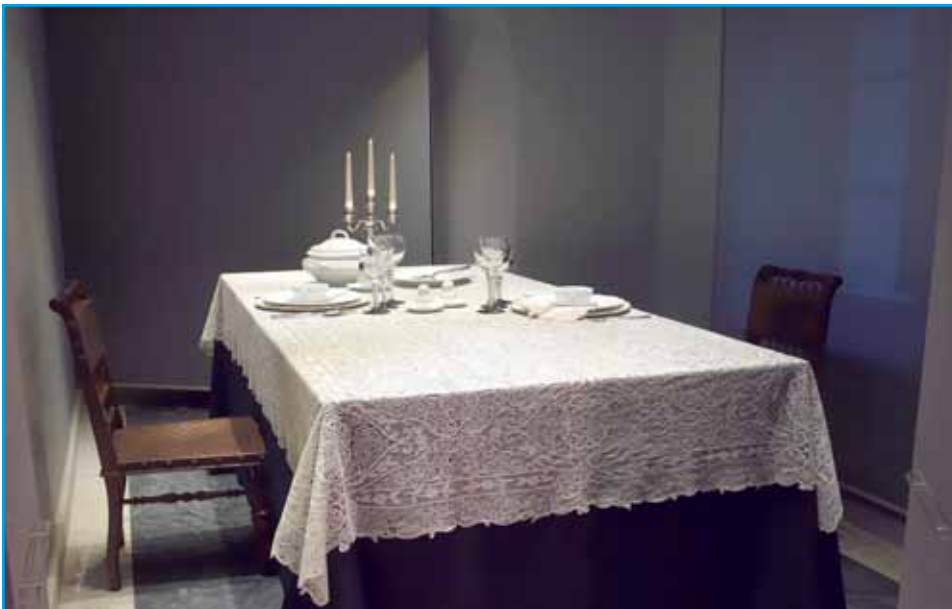
Table with Jovanka's tablecloth, one of the largest protocol products made of bobbin lace.

in Idrija by the meter (3.3 ft.), while in the 19th century lace began to be worked in parts (non-continuous lace). During the 1870, tape-lace worked in parts became predominant and gained widespread recognition throughout Europe under the name of Idrija lace.