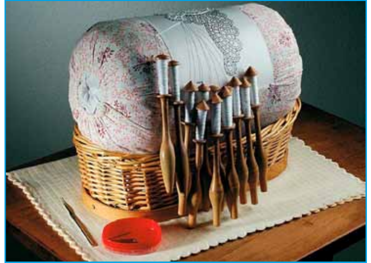
Lacemaking requisites and materials.

What better way to learn about Slovenia's history, art and heritage than by visiting various museums spread throughout the country? When making a list of things to do in Slovenia, do not forget about interesting galleries and museum collections. We will do our best to introduce as many as possible in our newsletter.