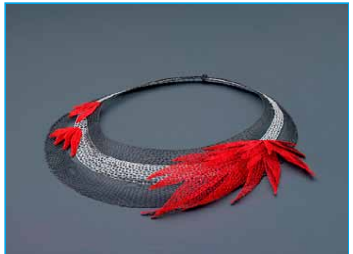
Lace necklace (2007).