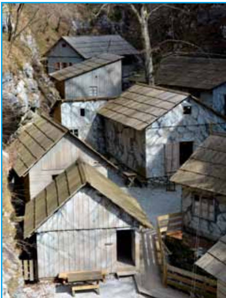
Franja Partisan Hospital in the Pasice gorge.