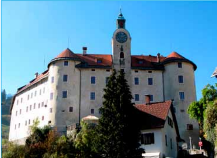
Gewerkenegg Castle in Idrija.