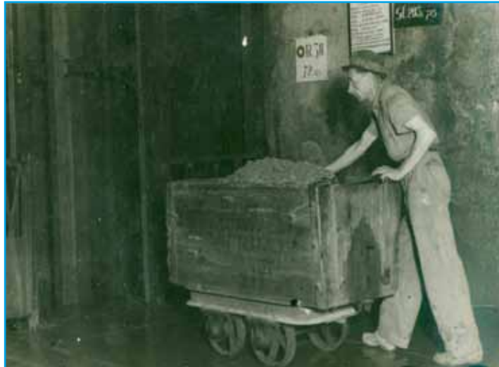
Transporting ore in the Idrija Mercury Mine.