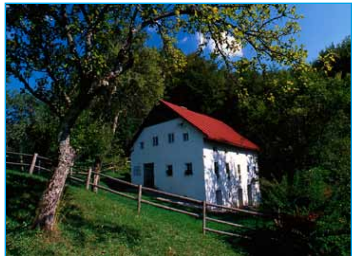
Homestead of Writer France Bevk in Zakojca.