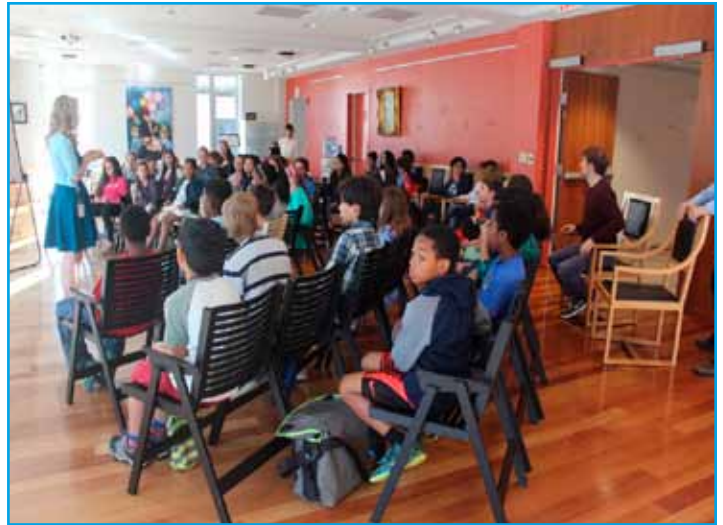
Learning about Slovenia.