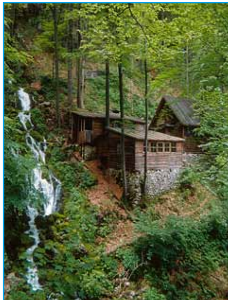
Slovenia Partisan Printing Shop on the Vojsko plateau.