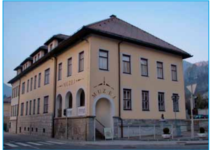
The Cerčno Museum.

What better way to learn about Slovenia's history, art and heritage than by visiting various museums spread throughout the country? When making a list of things to do in Slovenia, do not forget about interesting galleries and museum collections. We will do our best to introduce as many as possible in our newsletter.