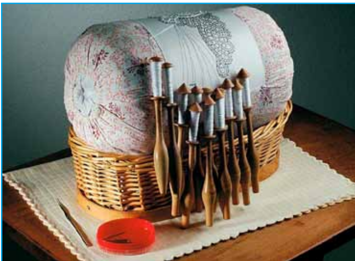
Lacemaking requisites and materials.