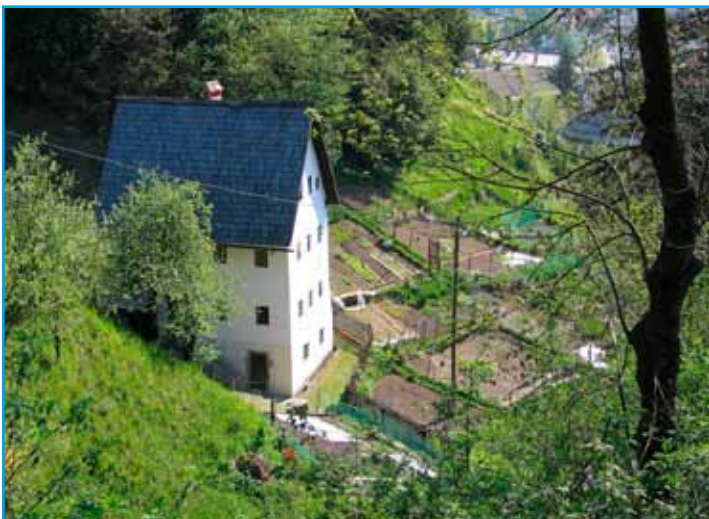
Idrija Miner's House.

Gewerkenegg Castle houses the Museum's main permanent