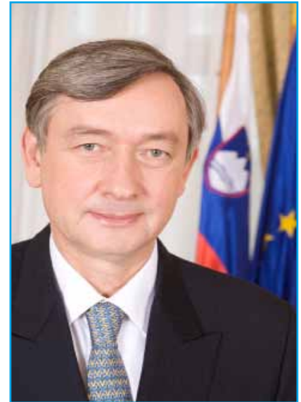
Dr. Danilo Türk

In accordance with Article 97 of the U.N. Charter, the U.N. Secretary General is appointed by the General Assembly upon the recommendation of the Security Council. The selection procedure for a new Secretary General was launched on December 15 with a