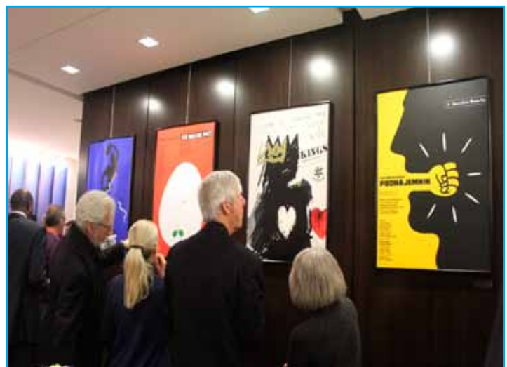
Jože Domjan is one of the leading Slovenian poster designers.