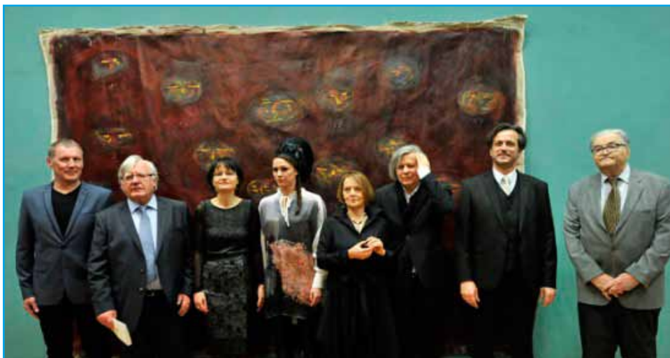
This year's recipients of Prešeren Prizes and Prešeren - Fund Prizes.