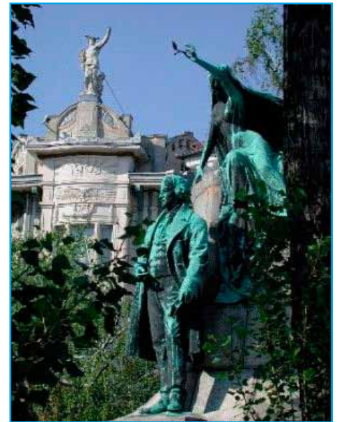
Monument dedicated to Prešeren in Ljubljana.