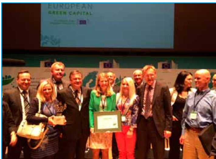
Ljubljana Mayor Zoran Janković at the ceremony at which the Slovenian capital took over as the European Green Capital from U.K.'s Bristol.

Within the Green Capital of Europe project, the City of Ljubljana has assigned a vital role to web communication. Via the www.greenljubljana.com web site, the city informs different target groups of its 'green' achievements and activities this year, when Ljubljana holds the prestigious title, and encourages them to contribute to a greener future themselves. Through representative projects that have guided Ljubljana's green story, it offers tips to individuals on how they can be more environment friendly and lead an active lifestyle in the Green Yourself section.