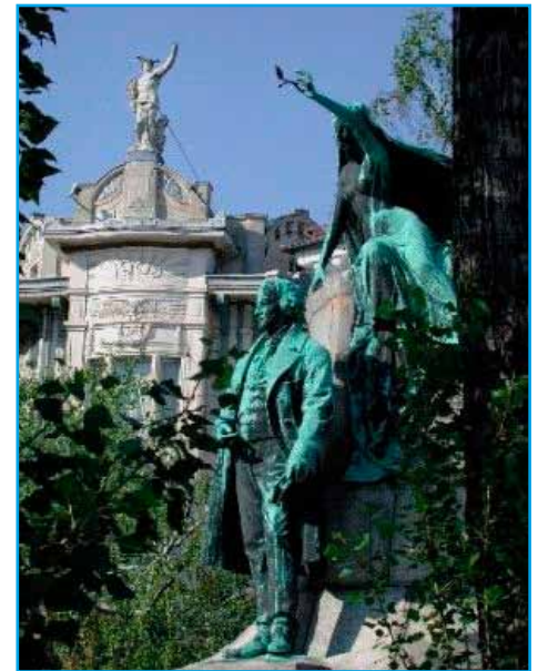
Monument dedicated to Prešeren in Ljubljana.