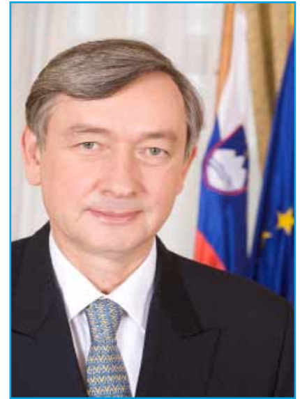
Dr. Danilo Türk

In accordance with Article 97 of the U.N. Charter, the U.N. Secretary General is appointed by the General Assembly upon the recommendation of the Security Council. The selection procedure for a new Secretary General was launched on December 15 with a