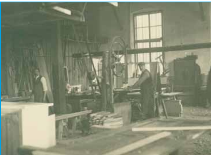
Band-saw in the period of its operation in Francis' shaft.

By the end of the 1950s, numerous machines and devices had been taken out of operation by the mine. For three decades, these precious specimens of technical mine heritage were on display to visitors in the courtyard of the Gewerkenegg Castle. Exhibited in open air, they were, unfortunately, exposed to varying weather conditions. Museum and other experts finally decided that the mine