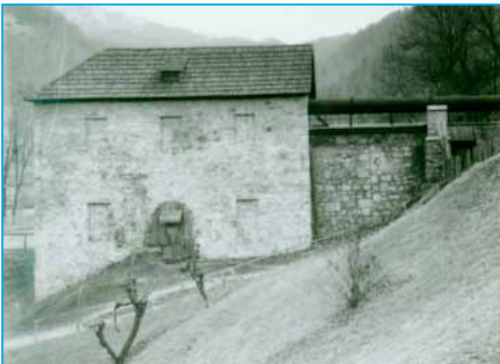
Building housing the kamšt in the period of Austrian rule.