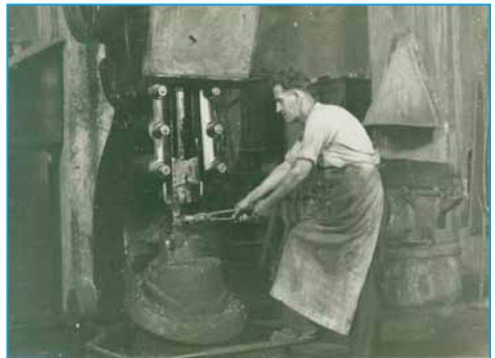
Pneumatic power hammer in the period of its operation in Francis' shaft.