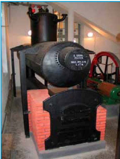
Battery steam boiler as a museum specimen.