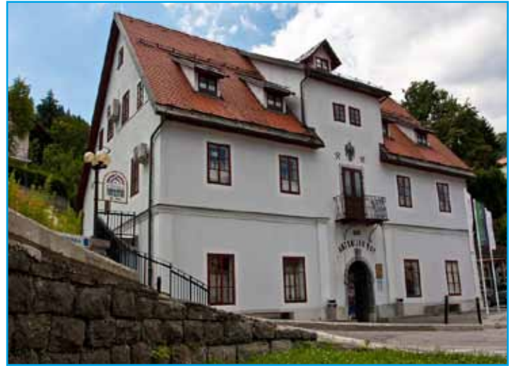
Entrance to Anthony's shaft.

What better way to learn about Slovenia's history, art and heritage than by visiting various museums spread throughout the country? When making a list of things to do in Slovenia, do not forget about interesting galleries and museum collections. We will do our best to introduce as many as possible in our newsletter.