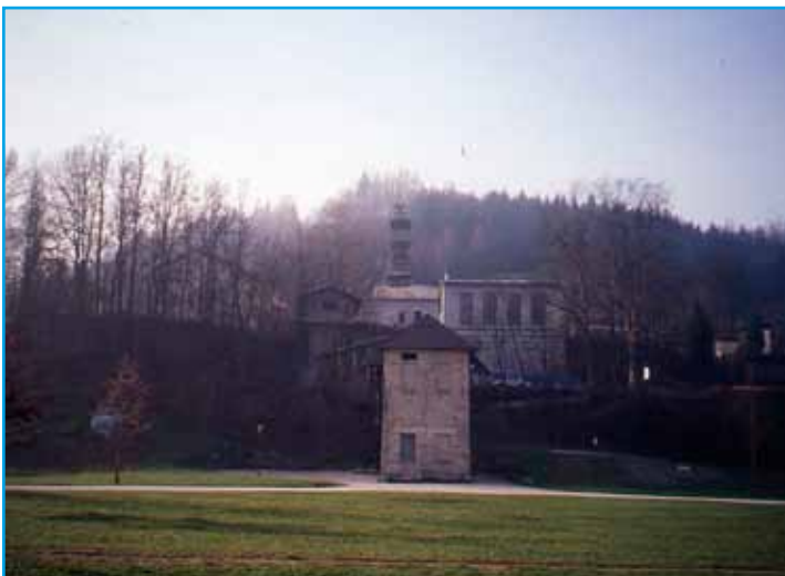
The kamšt operated until 1948.