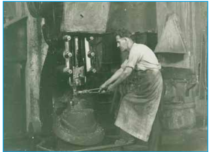
Pneumatic power hammer in the period of its operation in Francis' shaft.