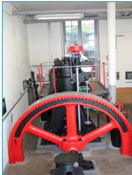
Diesel engine as a museum specimen.