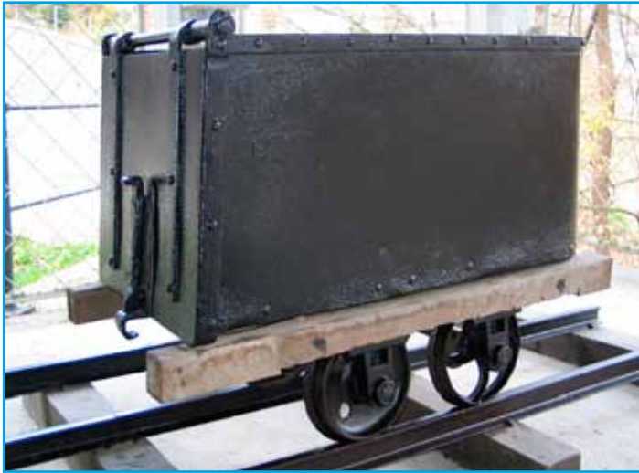
Ore transport car as a museum specimen.