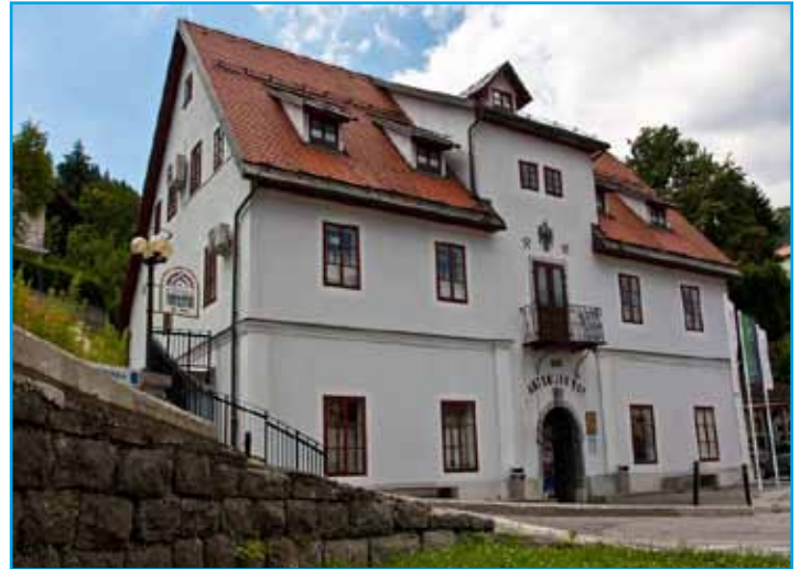
Entrance to Anthony's shaft.

What better way to learn about Slovenia's history, art and heritage than by visiting various museums spread throughout the country? When making a list of things to do in Slovenia, do not forget about interesting galleries and museum collections. We will do our best to introduce as many as possible in our newsletter.