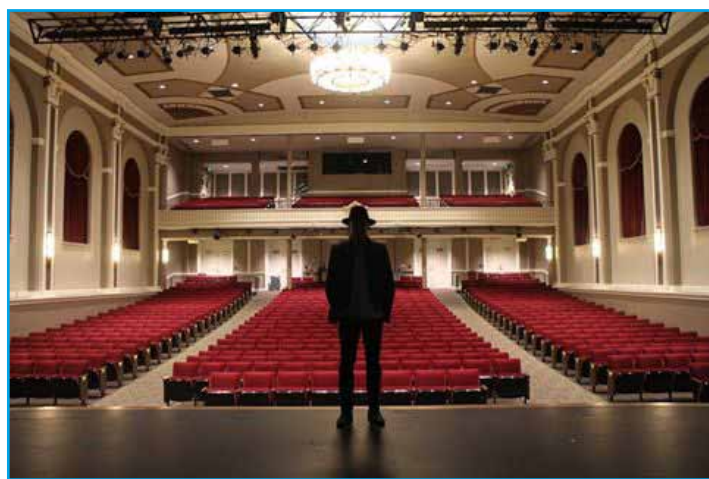
Slovenian National Home in Cleveland.