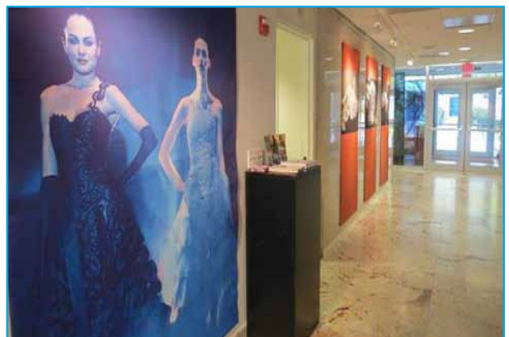
Idrija lace exhibition.