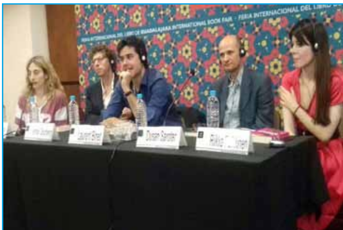
Panel at the Festival of European Literature.

two collections of short stories ( Mrtvi kot/ Blind Spot , 2002, and Nostalgia , 2010), three poetry collections ( Občutek za veter/Feel for the Wind , 2004, Krajina v molu/ Landscape in Minor , 2006, and Hiša mojega sina/ The House of My Son , 2009) and book of essays ( Ne morje ne zemlja/Not Sea Not Earth , 2012). Šarotar is also author of fifteen screenplays for documentary and feature films. His short film, Mario Was Watching the Sea With Love , based on the author's short stories from the collection Blind Spot and on his screenplay, won a Global short film award in New York, in 2016, and the first prize in Ningbo, China, for the "best short film" in the Central and East European film selection.