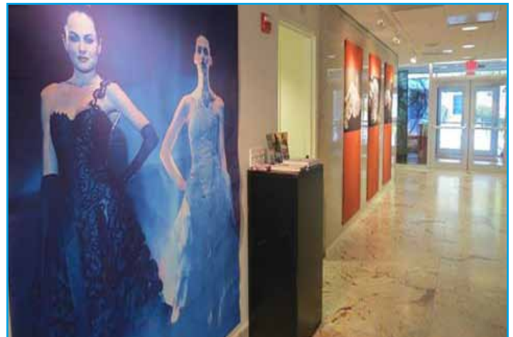
Idrija lace exhibition.