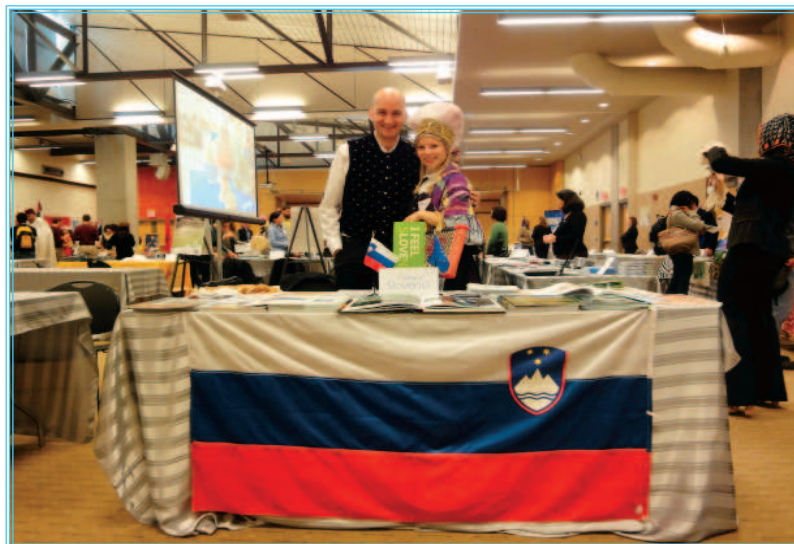
Slovenian Embassy at the Embassy Row.

On Thursday, February 23, 2012, the Catholic University of America (CUA) hosted the International Bazaar Featuring Embassy Row that aimed to capture the sights, sounds, and tastes of global cultures. Slovenian Embassy was among the presenters and participants at the International Bazaar, giving the CUA community an opportunity to learn more about what Slovenia has to offer.