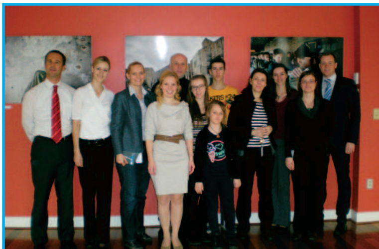
Kreslin family together with embassy staff, to whom Mr. Kreslin gave his latest CDs as presents.