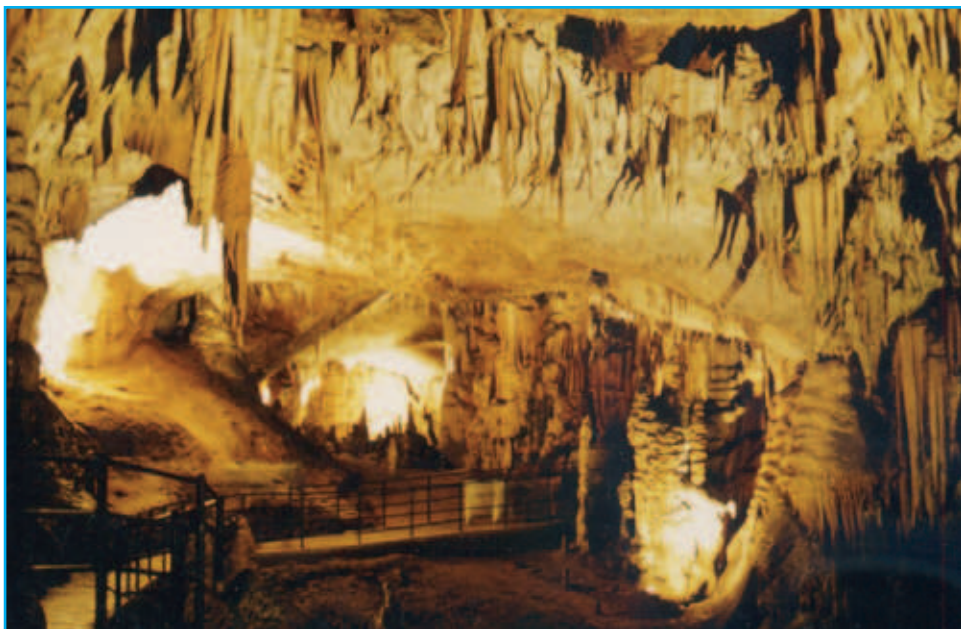
Postojna cave with its stalactites and stalagmites.

The city itself first developed along the foot of the Sovič hill and later – mainly after the construction of the Vienna-Trieste railway – spread around the edge of the basin. First mentioned in historic sources in 1226, Postojna was elevated to a borough in 1432.