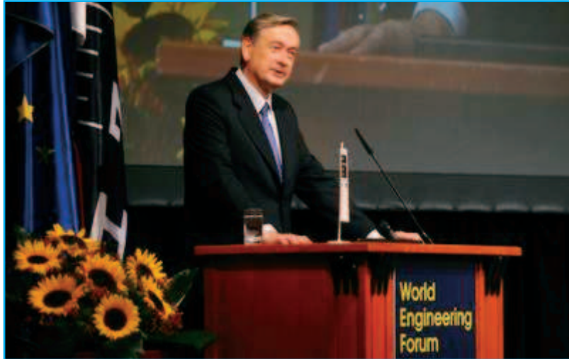
Opening address by Dr. Danilo Türk, President of the Republic of Slovenia, at the World Engineering Forum entitled "Sustainable Construction for People".

Keynote lectures were given by highly respected speakers from across the world who presented and exchanged their opinions about major challenges of