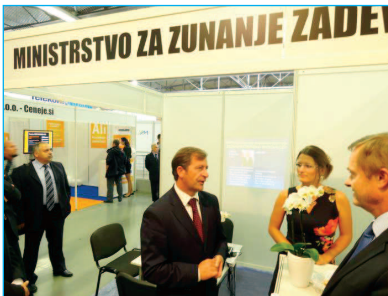
Minister of Foreign Affairs Karl Erjavec took part in the round table at the 45th International Trade Fair in Celje.

The round table provided an opportunity to present the activities of Slovenian economic diplomacy to Slovenian companies, and exchange ideas on how to improve existing cooperation. Minister Erjavec is convinced that seeking fresh opportunities is crucial when economic activity and exports are declining. He underlined the need for more intensive and diversified exports and the need to seek business opportunities in distant markets which have not been severely affected by the crisis.